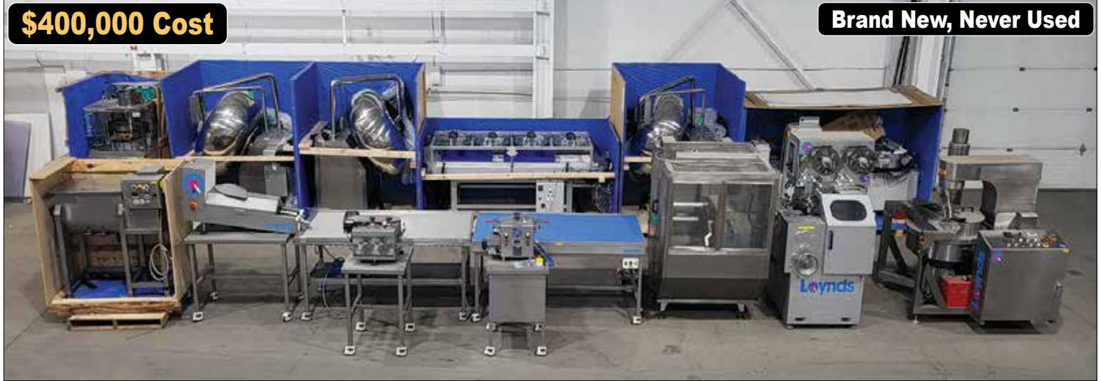
Loynds Candy Line for Taffy and Hard Candy