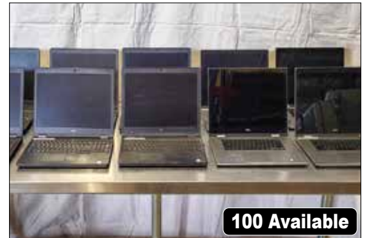
Dell Latitude 5590 and Inspiron Core i5 8th Generation