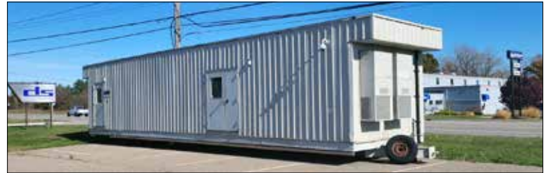
48' Custom Build Laboratory 4 Axle Trailer with Heat and A/C