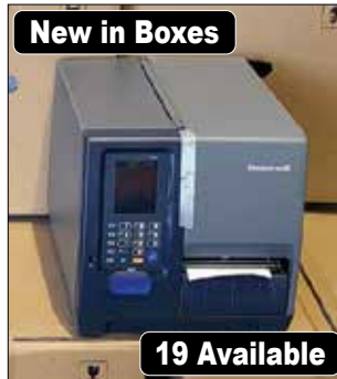
Honeywell Barcode Label Printers