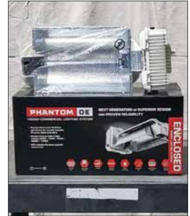
Phantom DE 1000 Watt LED Grow Lights