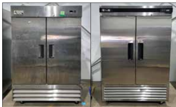
Views of Avantco Refrigerators