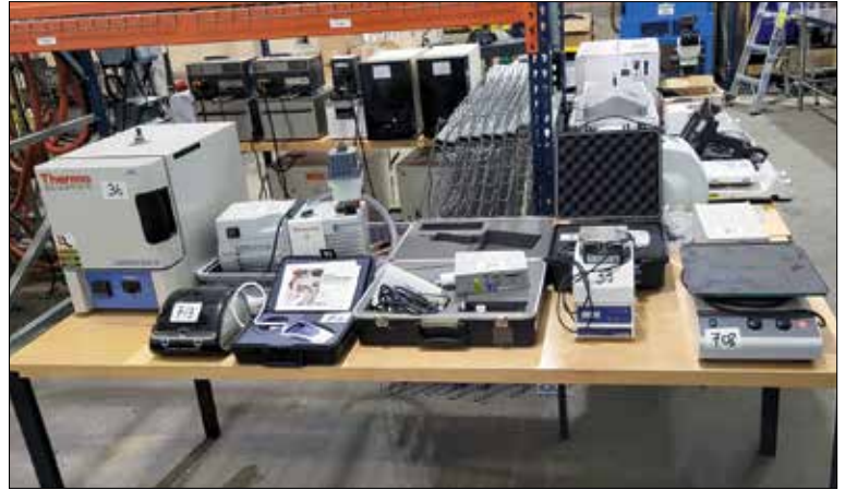
Views of Lab & Process Equipment