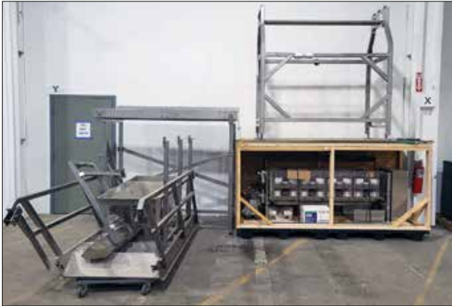
Green Vault Systems Precision Batcher