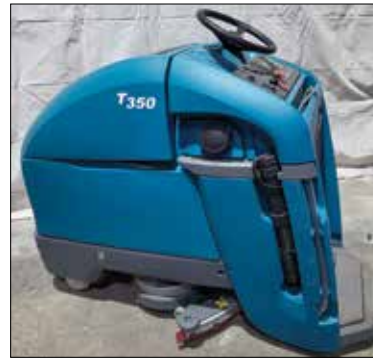
Tenant T350 Ride On Floor Scrubber