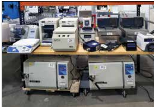
Lab & Process Equipment