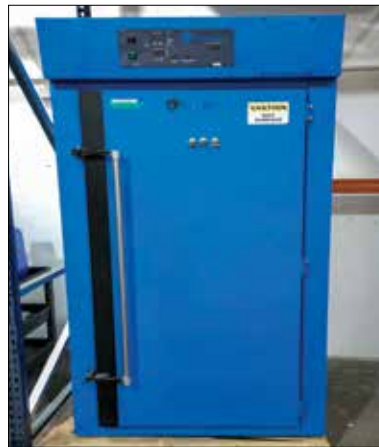
Cascade Drying & Decarboxylation Oven