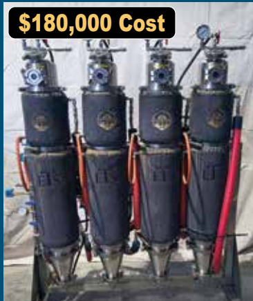
ETS MEP70 Extraction Platform