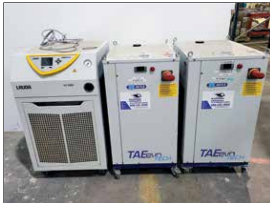
Lauda VC5000 Varicool and TAEvo Mini 10 Air Cooled Chillers