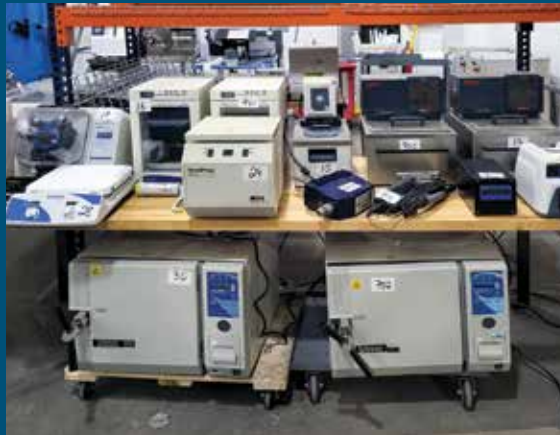
Lab and Process Equipment