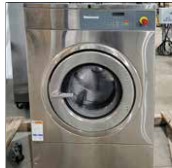
Huesch Commercial Dryer