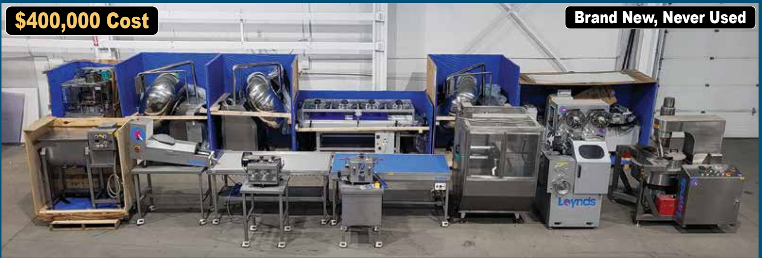
Loynds Candy Line for Taffy and Hard Candy