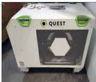
Quest 506 Dehumidifier