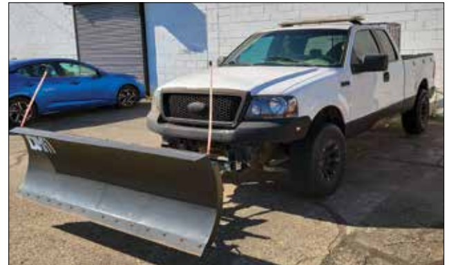
Ford F150 with Plow