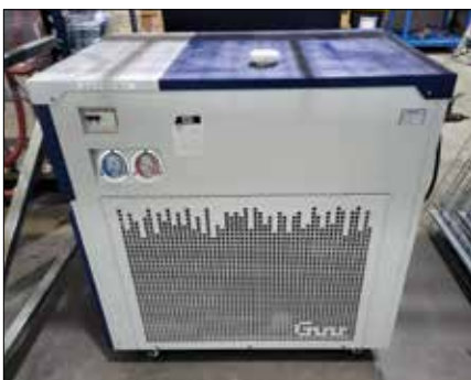
AI C30 40 50L Recirculating Chiller