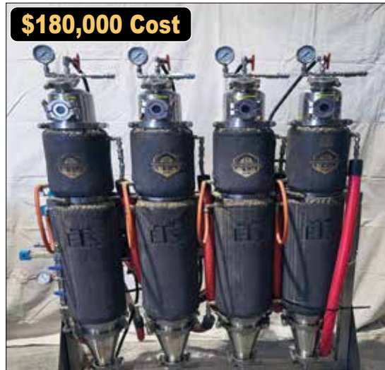
ETS MEP70 Extraction Platform