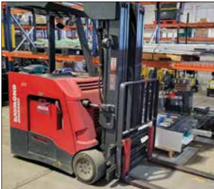
Raymond Stand Up Electric Forklift with Charger