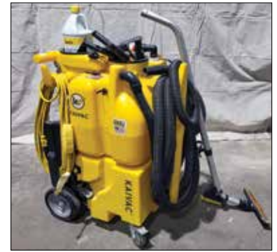
Kaivac KV17501 Vacuum