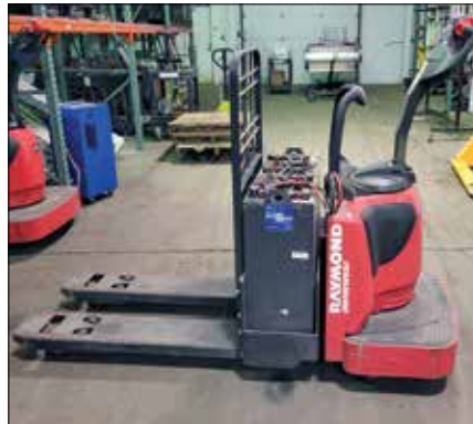
Raymond 8410 Electric Pallet Jack with Charger