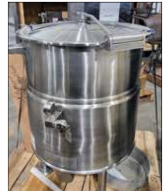
Cleveland Range Tilt Kettle