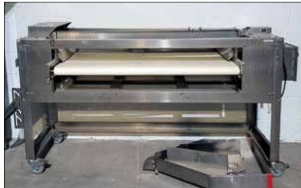
GreenBroz Vibratory Sorter