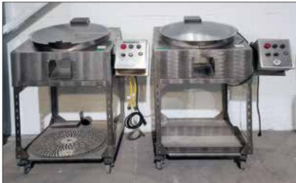
Greenbrier Dry Trimmers