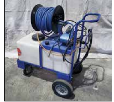
Dramm MSO Power Washer