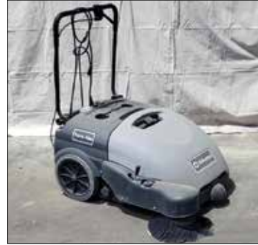
New Advance Terra 28B Floor Sweeper