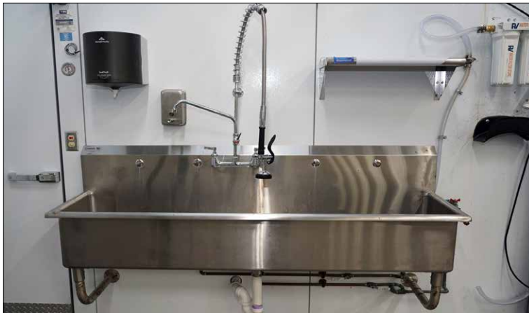
Stainless Steel Sink