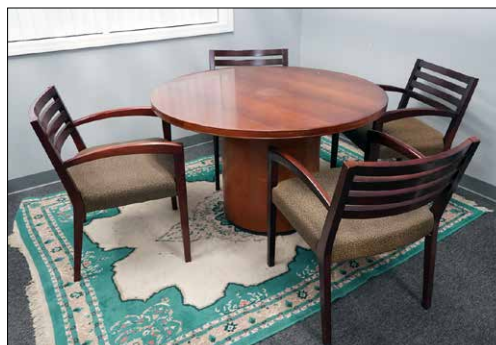
Executive Office Furniture