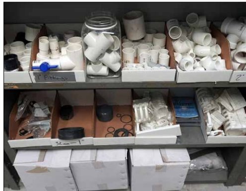
Partial Views of Spare Parts for Ponds