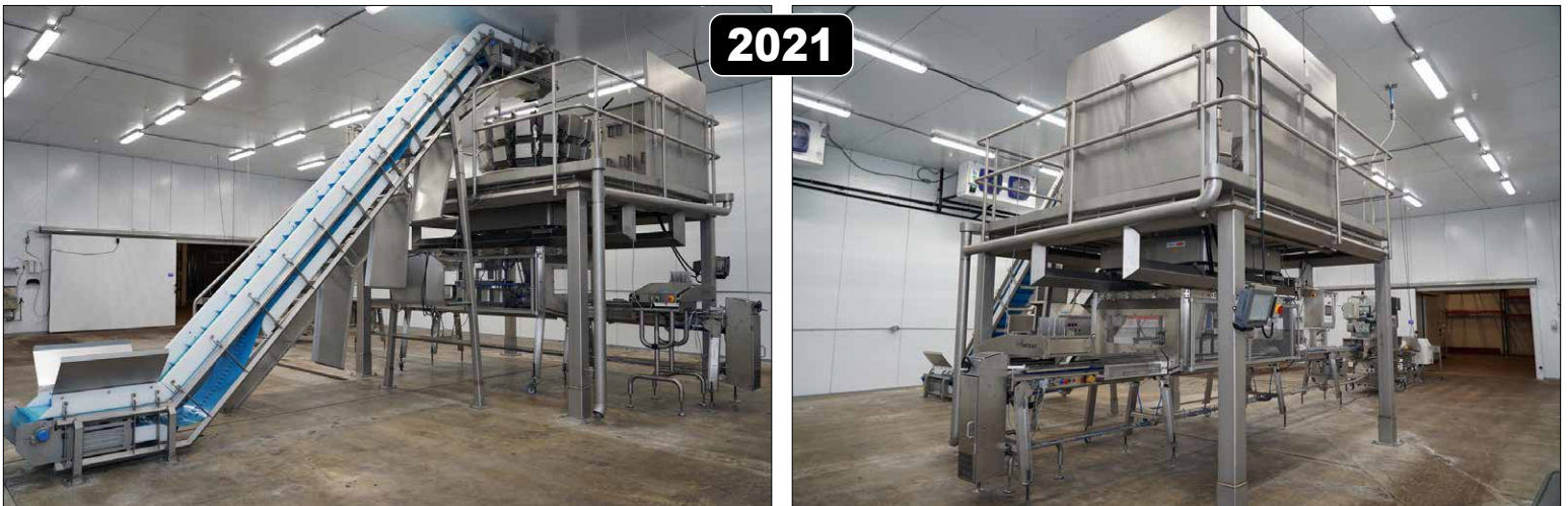
ProSeal CRO 14 Head Automatic Packaging and Sealing Line