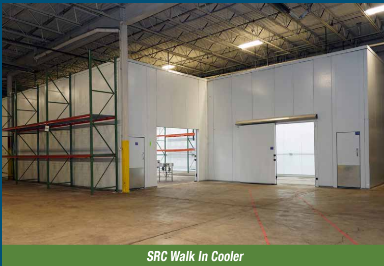
SRC Walk In Cooler