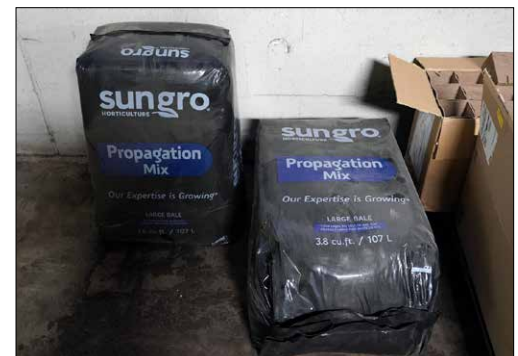
Peet and Growing Supplies