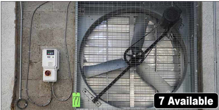
DryGair DGX 360 Air Circulation Unit