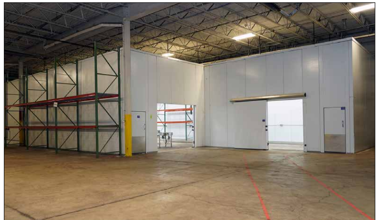
SRC Walk In Cooler

BASIL AND LETTUCE SRC REFRIGERATION WALK IN COOLERS , Reaches 34 Degrees F, Dimensions are 87 ft x 39 Ft x 16 Ft Tall Ceilings, (2) Heatcraft Model LCH0070MCACZC0753 Condensing Units, 208 - 230 Volts, 3 Ph, 60 Hz, and (2) 2 Fan Walk In Unit Coolers Units Heatcraft Model LEM0475B67AM-AB0200, 208 -230 Volt, 1 Ph, 60 Hz, 2 - 1/4 HP, Electric Defrost, FPI 6, Dual Rated True, No. of Fans 3, Rated Point F- 10F TD -20F SST, Refrigerant co2, Application Capacity 43,000, CFM 6,500, Height 28 5/8", Depth 20 1/4", Length 95.7/8", Net Weight 288 Lbs, Fins Per Inch 6, Motor Type 1 Speed EC, Motor HP 1/4", Unit MCA 15, Unit MOPD 20, Motor Voltage 208-230/1/60, Motor Watts 625, Motor Amps, 5.2, Defrost Heater Voltage 208-230/3/60, Defrost Heater Amps 23.2, Defrost Heater Watts 7750, Coil Inlet OD 2-Jan, Suction OD 2-Jan, External Equalizer OD N/A, Drain MPT 4-Mar, Fan Diameter 457mm, Air Throw Standard 60 Ft, Air Throw Standard 18.5m, Air Throw, with Collar 45 Ft, Air Throw, with Collar 14, FPI 6, S/N T21021517 / T21021566, (1) 4 Fan Walk In Unit Cooler, Haet craft Model LEC0250A67AMAB0200 115 Volt, 1 Ph, 60 Hz, 4 Fans, -1/20 HP, FLA EA 0.9, MCA 3.6, MOPD 20, with IntelliGen Evaporator Controller, (2) Big Sliding Doors and (3) Man Doors