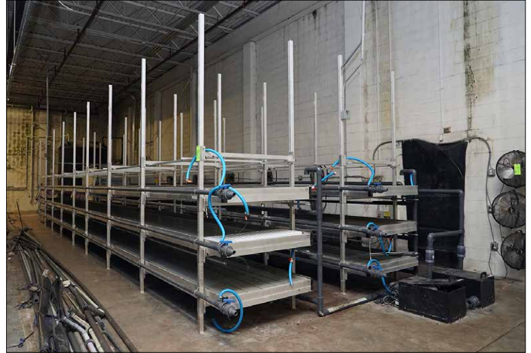
GGs Seed Tray Conveyors