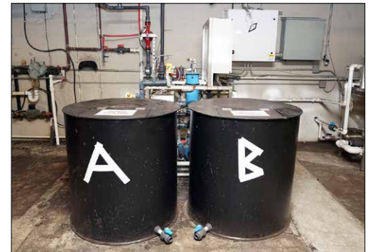
Views of Irrigation Systems