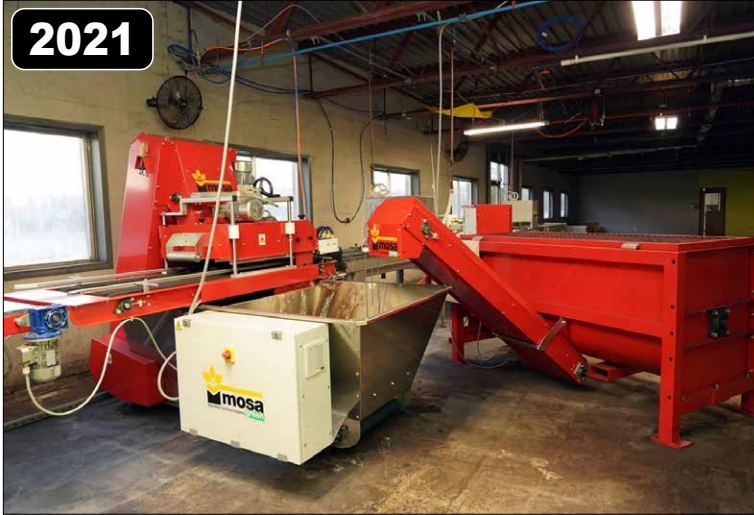
Mosa OrloFloro Vivaismo Green Automatic Tray Seeding Line

(2) GROWLINK PRECISION IRRIGATION CONTROLLERS, 4 Irrigation Valve Outputs, Compatible, with Terralink, Teros 12 or Acclima TDR Sensors, 4 Zone Base Controller, Run up to 4 Standard 24 Volt Solenoids at Once, Unlimited Sensor Triggers, Timers and Schedules, Connects to the Growlink Cloud, Volumetric Water Content, Soilless Media Calibration: 0.0-1.0 m3/m3, Apparent Dielectric Permittivity 1 (air) to 100 (Water), Accuracy +- 0.02 for 0-53%; +-0.04. for 53-100% in any Porous Medium, Temperature Range -40C - 85C, Resolution 0.10C, Accuracy, +-0.4C From -40 to 0 -+ 0.3 from 0 to +85 C