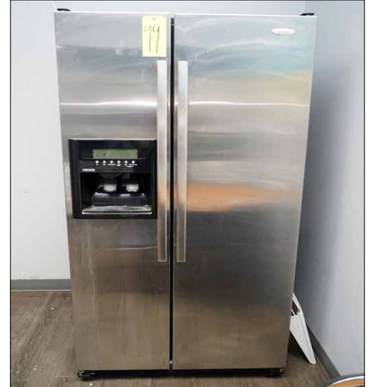
Whirlpool Stainless Steel Refrigerator

EXECUTIVE OFFICES • OFFICE CUBICLES • COMPUTERS & MONITORS