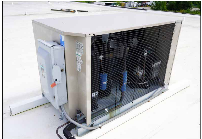
Daikin Manufacturing 5 Ton Chiller