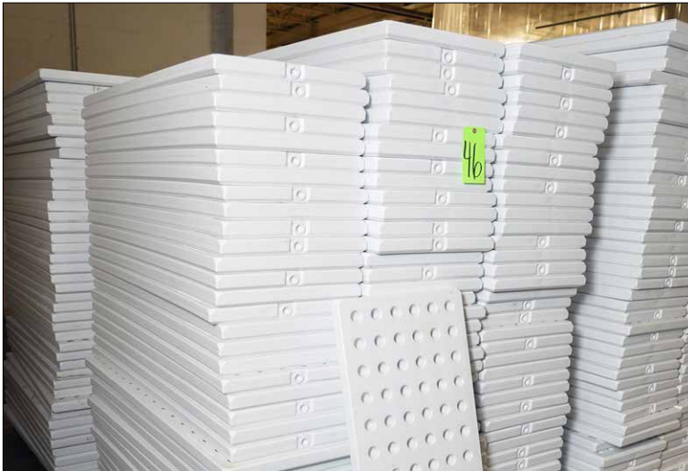
Dry Hydroponics Seed Trays