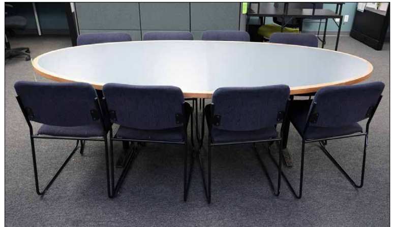
Conference Table and Chairs