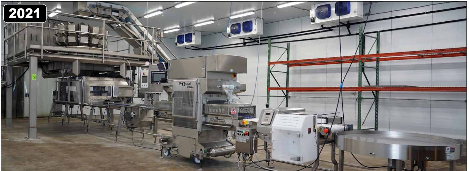
ProSeal CRO 14 Head Automatic Packaging and Sealing Line