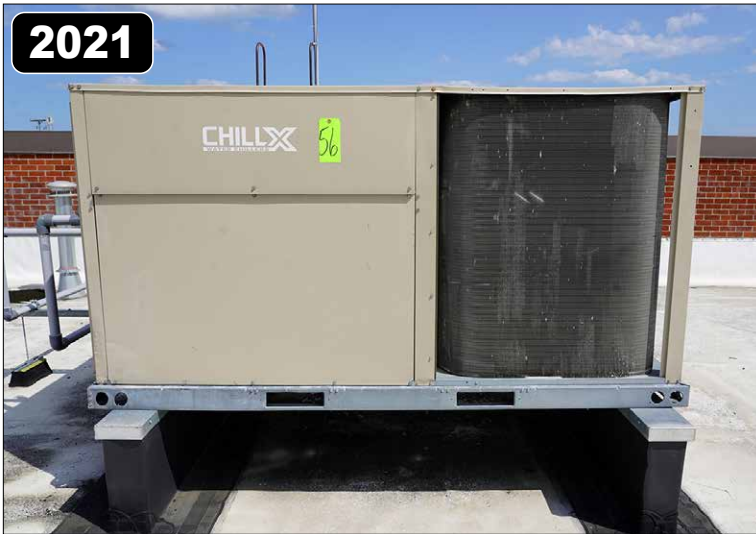
ChillX 30 Ton Water Chiller

(2) LIEBERT CORP, MODEL 6540 , 4 Fan Microchannel Condenser Units, 460 Volts, 3 Ph, 60 Hz, 12 FLA, Min CKT Amps 28, Max Fuse Amps 15, Fan Speed Control Motor Data 230 Volts, Single Phase, 60 Hz, 4.88 FLA, 3/4 HP, Auxiliary Motor Data, 460 Volts, 3 Ph, 60 Hz, 3.4 FLA, 1 HP, Working Pressure 400 PSIG, Suitable for Outdoor Use, Suitable for R-12, R-22, and R-500, S/N 26980-6 & 26982-4