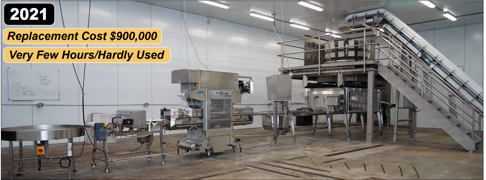
ProSeal CRO 14 Head Automatic Packaging and Sealing Line