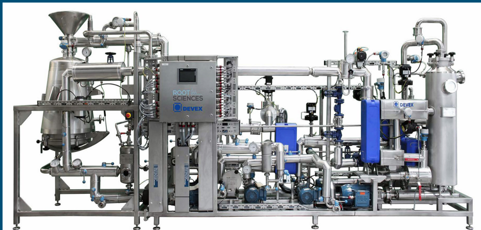
Root Sciences CryoExs 400 Cro Ethanol Extraction System