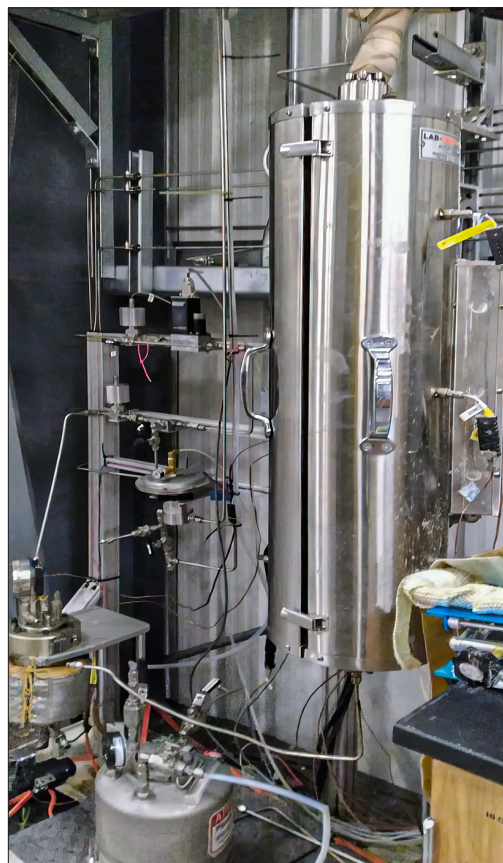
Parr 0.5 liter 3 Zone Continuous-Flow 3,000 PSI Fixed Bed Tubular Reactor

HIGH PRESSURE STAINLESS STEEL 5 LITER 350° C AGITATED AUTOCLAVE REACTOR , 500 PSIG, External Insulated Ceramic Band Heater, 1/4 HP AC Variable Frequency Drive Motor & Drive with Digital RPM Meter, Shaft Sealing, Zero Leakage Magnetic Drive Coupling. (Maintenance Free), Stirrer, 6 Blade 100-1,750 RPM Vari Speed Turbine Impeller, Standard Fittings. External Fittings: Pressure Gauge, Vent Valve, Safetyrupture Disc, Gas Inlet-Valve & Liquid Sampling Valve Mounted on Common Dip Tube. Internal Fittings: Internal Cooling Coil, Thermowell (with Temp. Sensor), Dip Tube. Gasket, Teflon with Split Clamp Type Quick Opening System. SS Control Panel with Microprocessor Programmable P.I.D. Temp Controller with High Temp Alarm. 575 VAC±10%, 60Hz, Lawler DR-2L Bench Top Pour Point, Cloud Point and CFPP Tester. Operating Temperature Range 0° C to -70° C