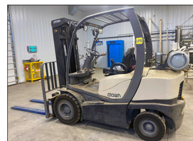
Crown C-5 5,000# Capacity LP Forklift