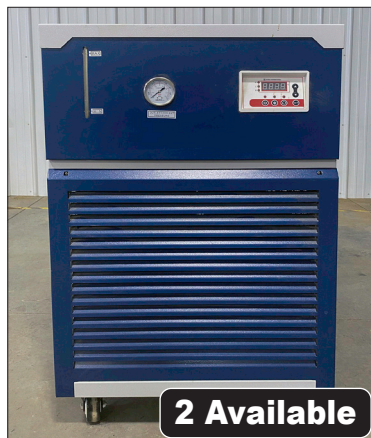
AI Model C30-40-50L Negative Chiller