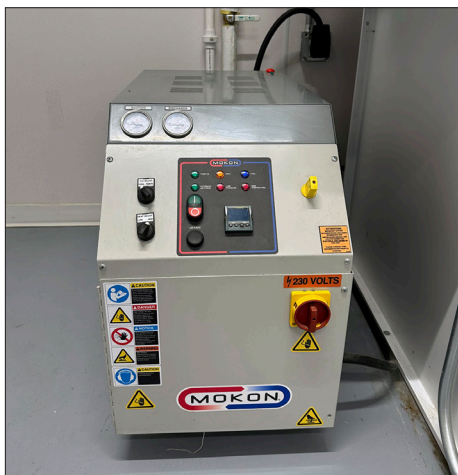
Components of HAL C1D1 Model 150U Extraction Booth