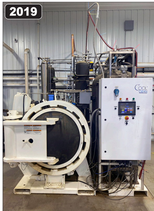
Cool Clean Model BX-62-480-610 Extraction System