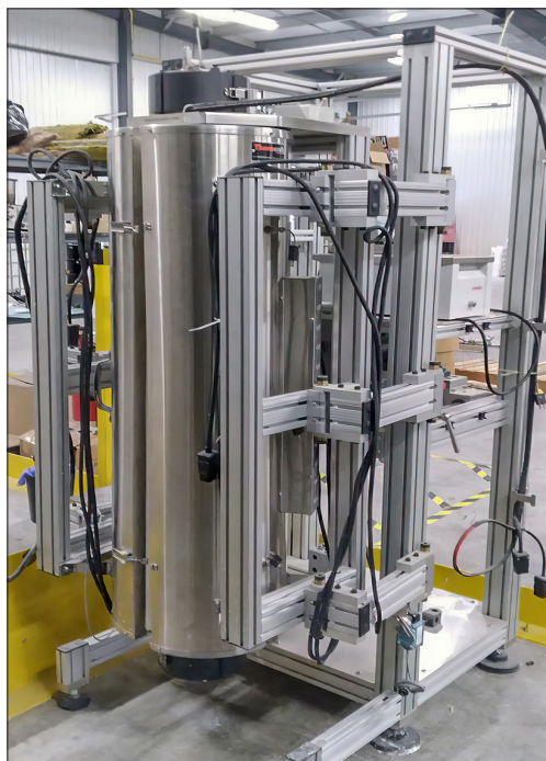
Parr 15 liter 3 Zone Continuous-Flow 1,400 PSI Fixed Bed Reactor