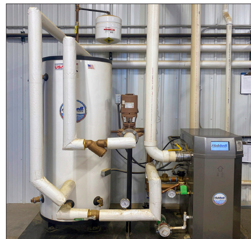
Hubbel Model NX500-XX Gas Fired Industrial Heater