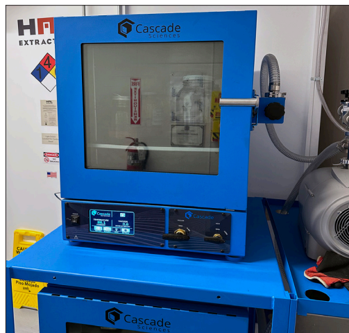
Cascade Sciences Model CVO-5 Vacuum Oven

HUBBEL MODEL NX500-XX GAS FIRED INDUSTRIAL HEATER