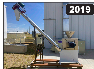
CME ECO-HMS 30 HP Hammermill