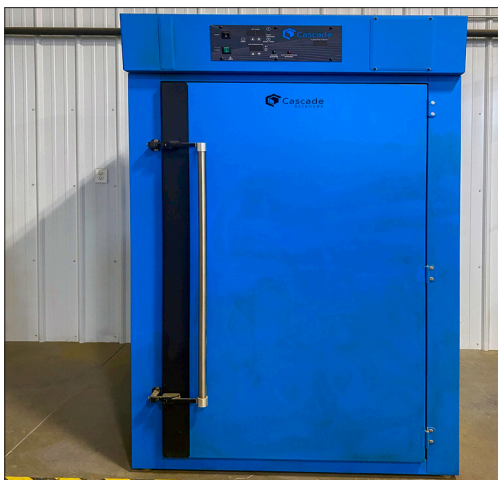
Cascade Model CDO-28 Drying & Decarboxylation Oven