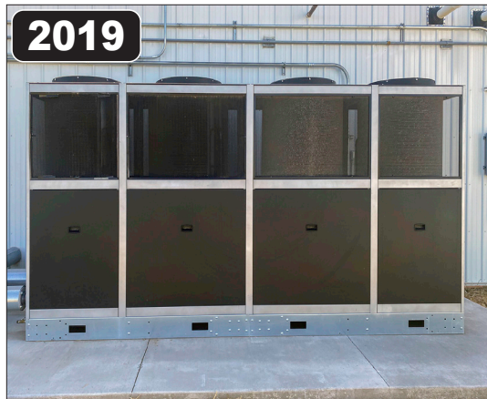
Delta Systems CSPA-0605 60 Ton VAR Air Cooled Chiller