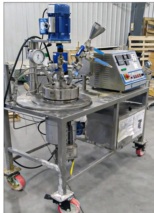
High Pressure Stainless Steel 5 Liter 350° C Agitated Autoclave Reactor