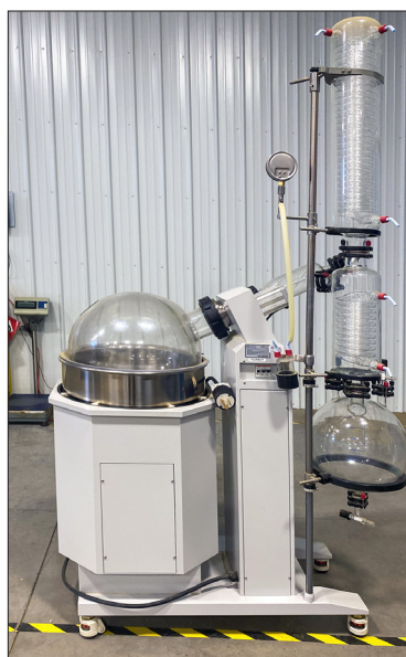
Solvent Vap SE 130 50L Rotary Evaporator