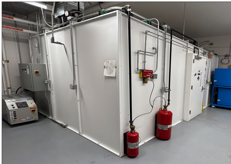
Views of HAL C1D1 Model 150U Extraction Booth