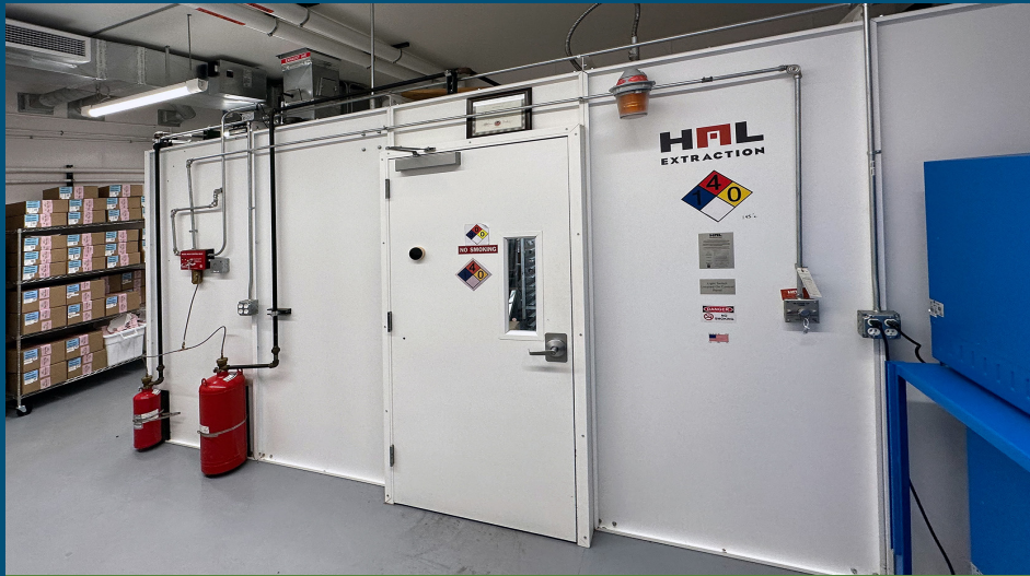
HAL C1D1 Model 150U Extraction Booth

INSPECTION: Inspection by Appointment Only • Multiple Locations • Set Lot Info. for Details