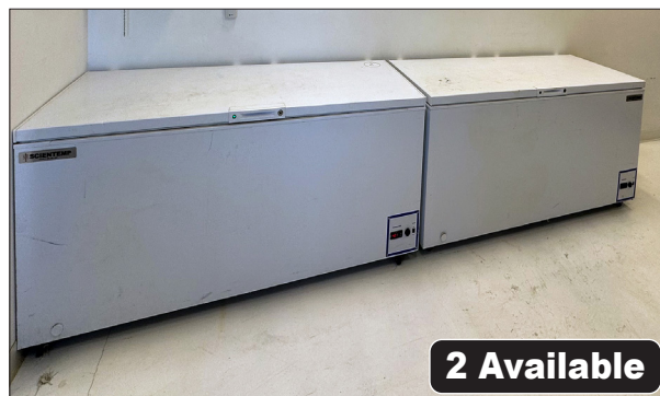
Scientemp Model 34-20A Sub Zero Freezers