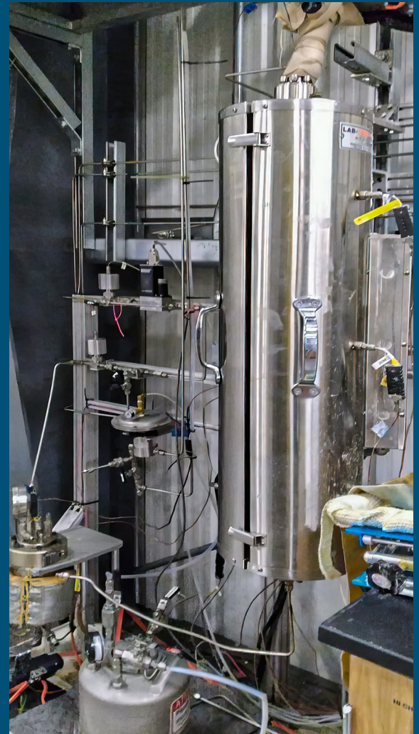
Parr 0.5 liter 3 Zone Continuous-Flow 3,000 PSI Fixed Bed Tubular Reactor