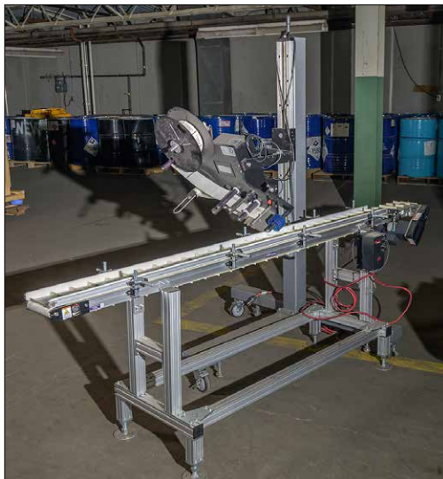
ID Technology ST1000 Economical Label Applicator