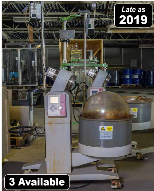
Across International Solvent Rotary Evaporators