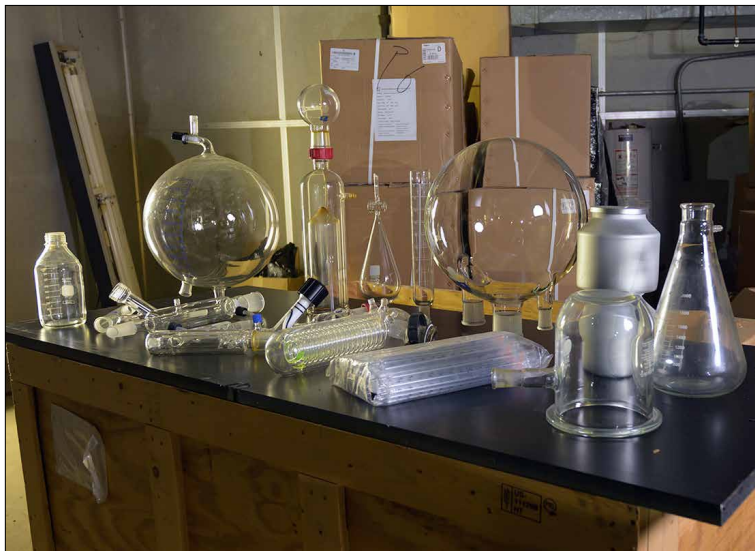
Large Quantity of New and Used Assorted Chemistry Glassware