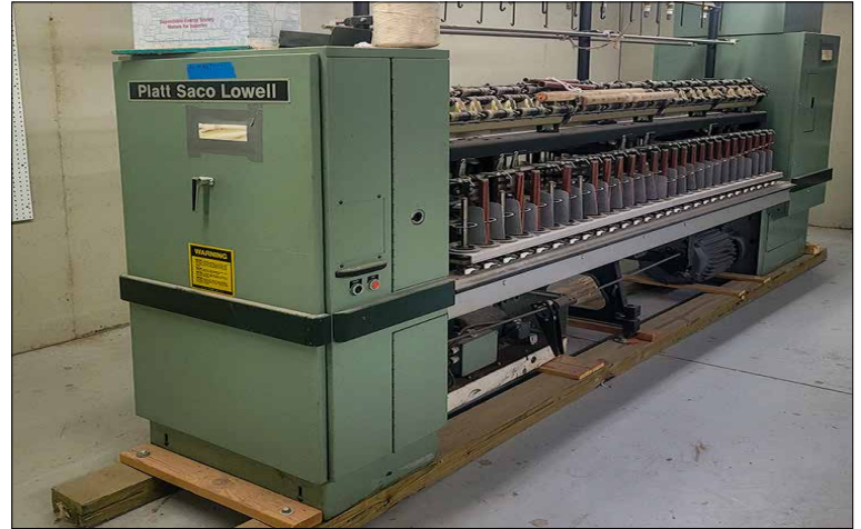
Platt Saco Lowell Spinning Frame

TRAFU-UNION TSU35241K 3 PHASE TRANSFORMER , S/N 0532, (1989)