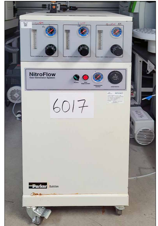
Parker Ralston Nitro Flow SF130972PHA Gas Generating System