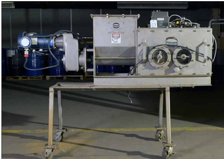
Vincent OP4 Dewatering Screw Press