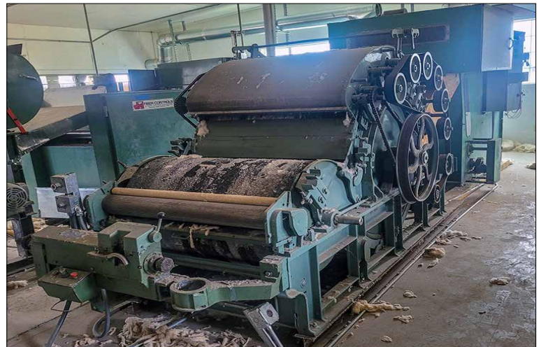
Saco Lowell Pettee 45" Card