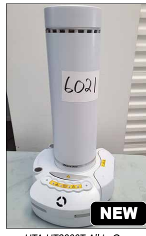
HTA HT2800T All in One Auto Sampler