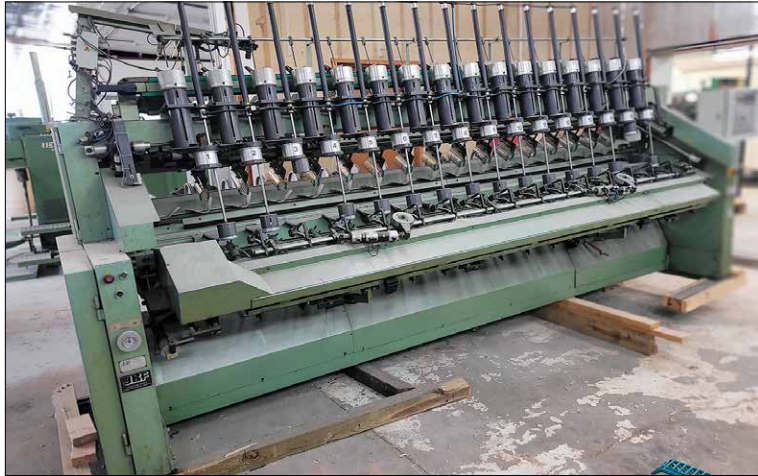
JBF KW7654 Spinning frame

FIBER LOCKER NEEDLE FELTING LOOM , with a double row of felting needles. Production rate will be determined by different types of felt used.