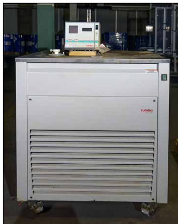
Julabo FP-55 Hight Tech Ultra Low Refrigerated / Heating Circulator