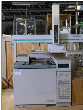
CTC Analytics Combi Pal Gas Chromatograph