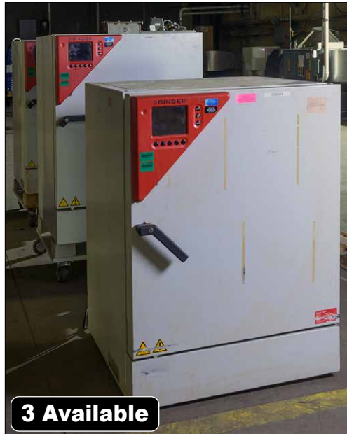
Binder CB-150-UL Co2 Incubators