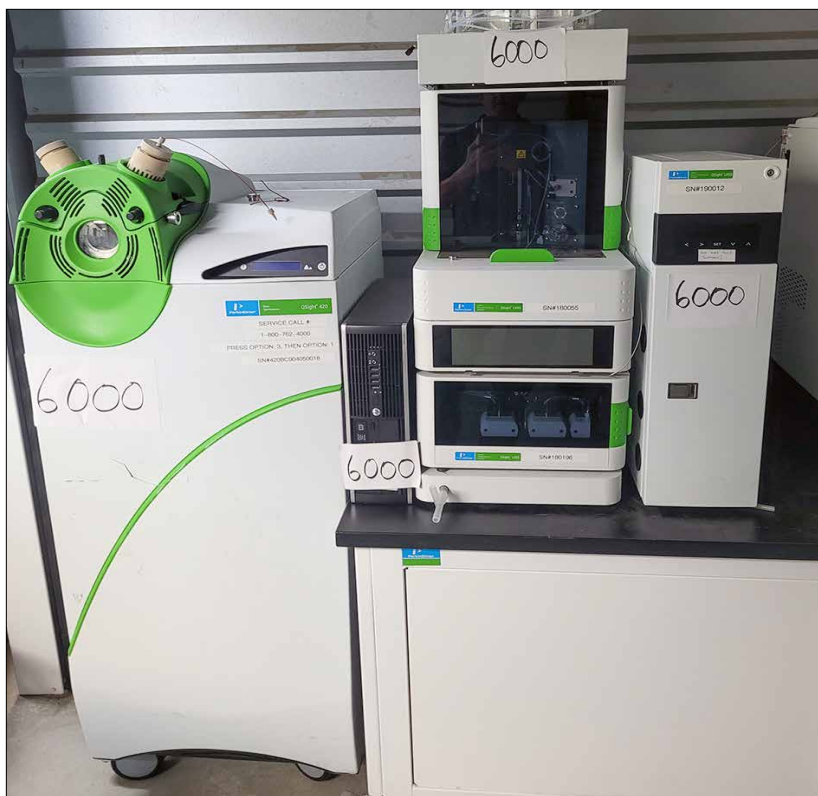
Perkin Elmer Q Sight Triple Quad LC/MS/MS Mass Spectrometer 420

HTA HT2800T ALL IN ONE AUTO SAMPLER , (New), S/N 405358