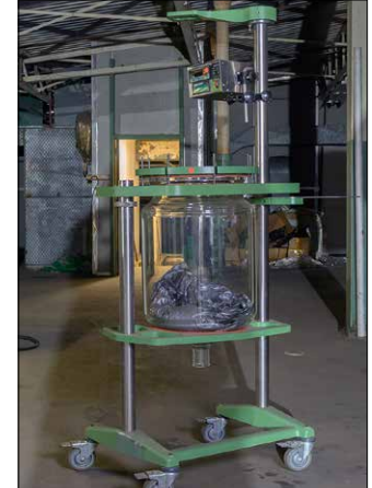
Chem-Glass C147659 Single / Dual Jacketed Reactor System