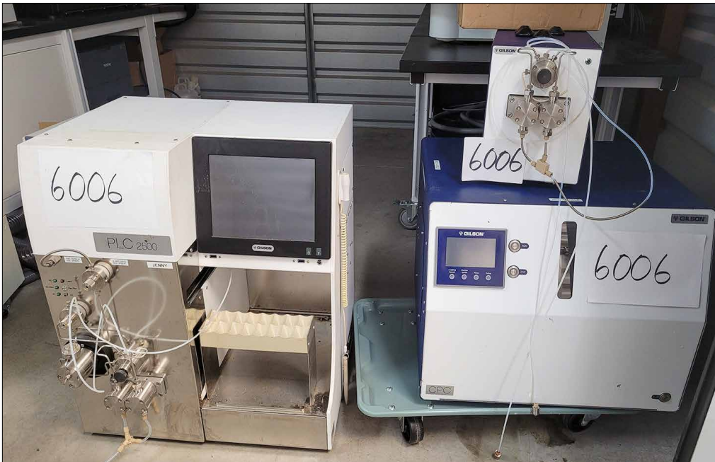
Gilson PLC 2500 Purification System

EDWARDS 12 VACUUM PUMP , S/N 190141734 SOGEVAC SV40 VACUUM PUMP , S/N 31001941857 SOGEVAC SV120 VACUUM PUMP , S/N 31001926735 POLYSCIENCE MODEL N0772046 CHILLER , S/N 1812-01238, with Turbine Pump, Water Cooled ATLANTIC BLOWERS MODEL AB-71-011 BLOWER MOTOR , S/N 3463SL