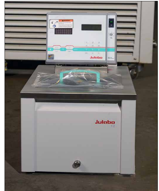
Julabo SL-12 Heating Circulator