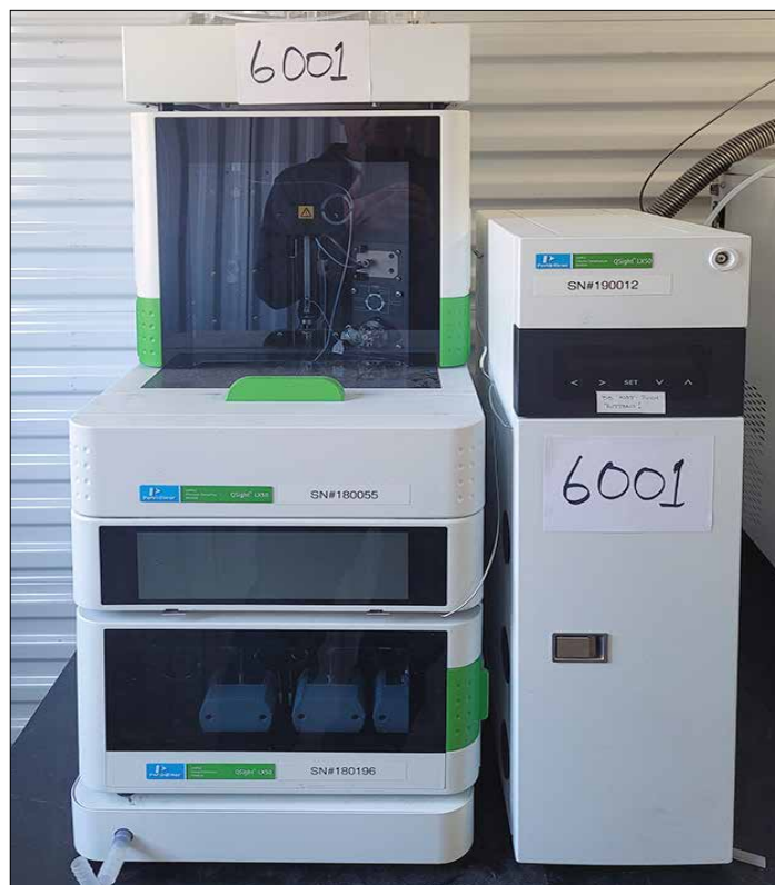
Perkin Elmer Q Sight Triple Quad LC/MS/MS Mass Spectrometer 420