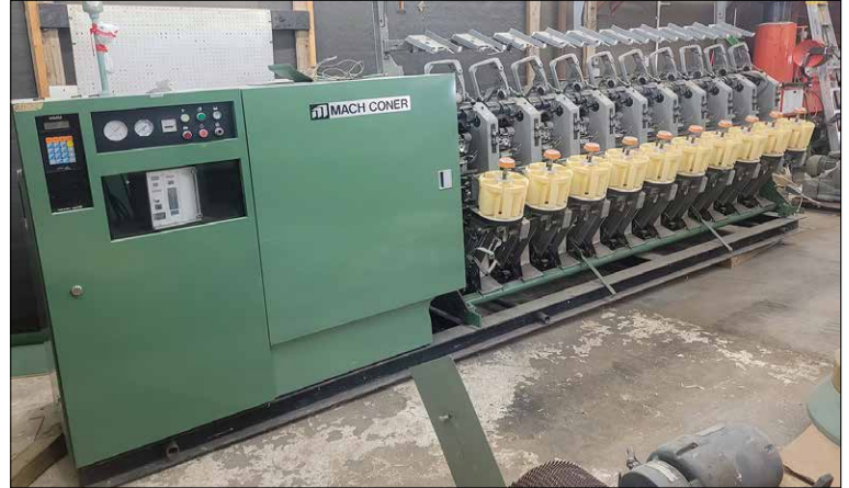
Murata Machinery 7-2 Mach Coner

MURATA MACHINERY 7-2 MACH CONER , S/N 88SX-351200-01, (1988), Cone winder with room for 6 bobbins in the feeding cans, and can produce approx. 30 1lb cones/hour