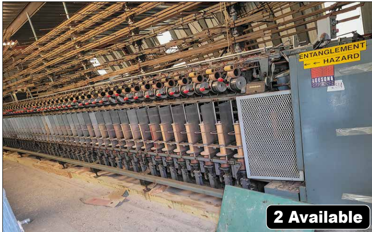
Leeson 514 Twister