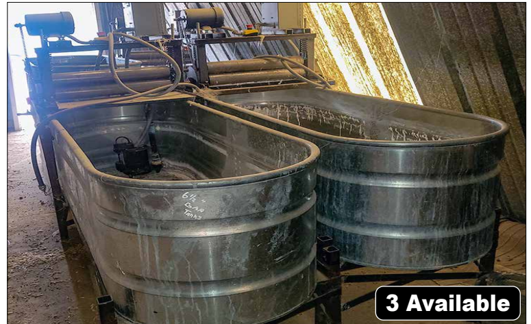
Custom Built Fiber Scouring and Degumming Tub