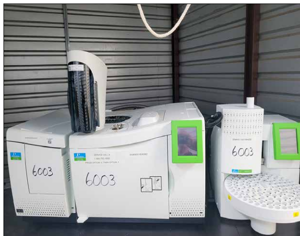
Perkin Elmer Clarus 690 Gas Chromatograph