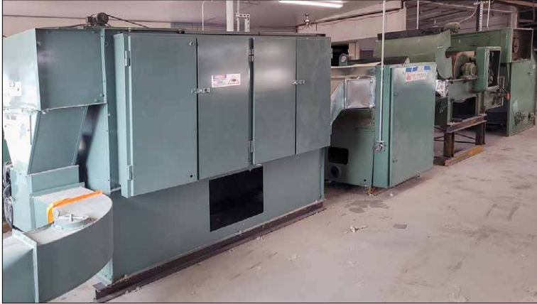
Fiber Decortication and Cleaning Line

FIBER DECORTICATING AND CLEANING LINE , consisting of: Hunter Hopper/Feeder (1977), Fiber Controls Model ROCX36, S/N 177 Fine Opener, Centrif-Air XL 360 Cleaner. Capacity: Approx. 300 lbs/hour