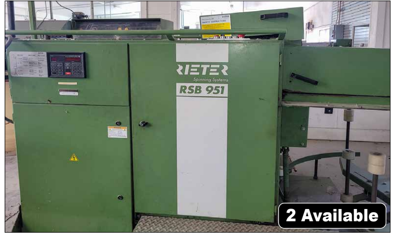
Rieter RSB 951 Draw Frame

(2) RIETER RSB 951 DRAW FRAMES , (1996), with automatic doffing. Feeds 6 cans, capacity of approx. 300 lbs/hour