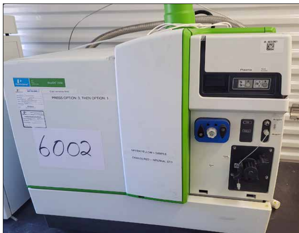
Perkin Elmer NexION 2000 Mass Spectrophotometer