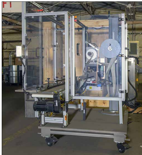
RD Custom Automation Labeling System, with Enclosure