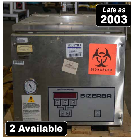
Bizerba 350 Vacuum Sealers