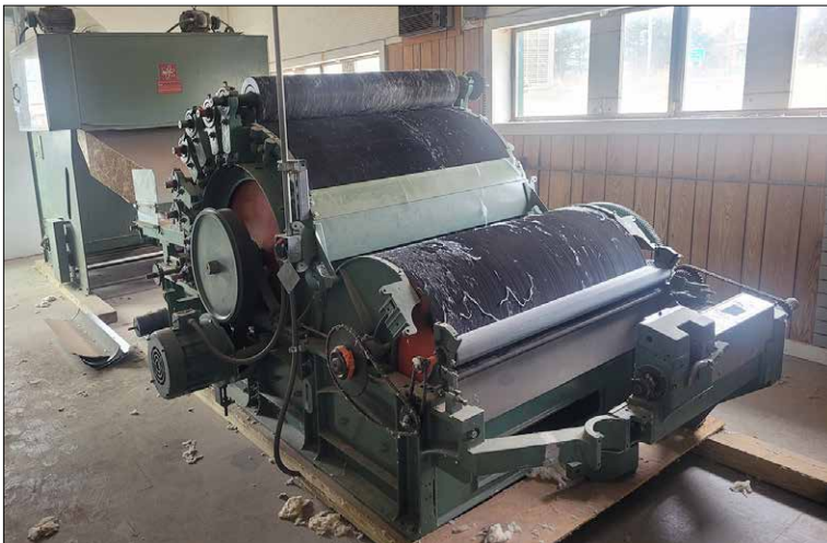
Whitin 40" Rollertop Card

SACO LOWELL PETTEE 45" CARD , with 4 sets of Workers/Strippers, Approx. 300 lbs/hour WHITIN 40" ROLLERTOP CARD , with 4 sets of Workers/Strippers, Approx. 300 lbs/hour