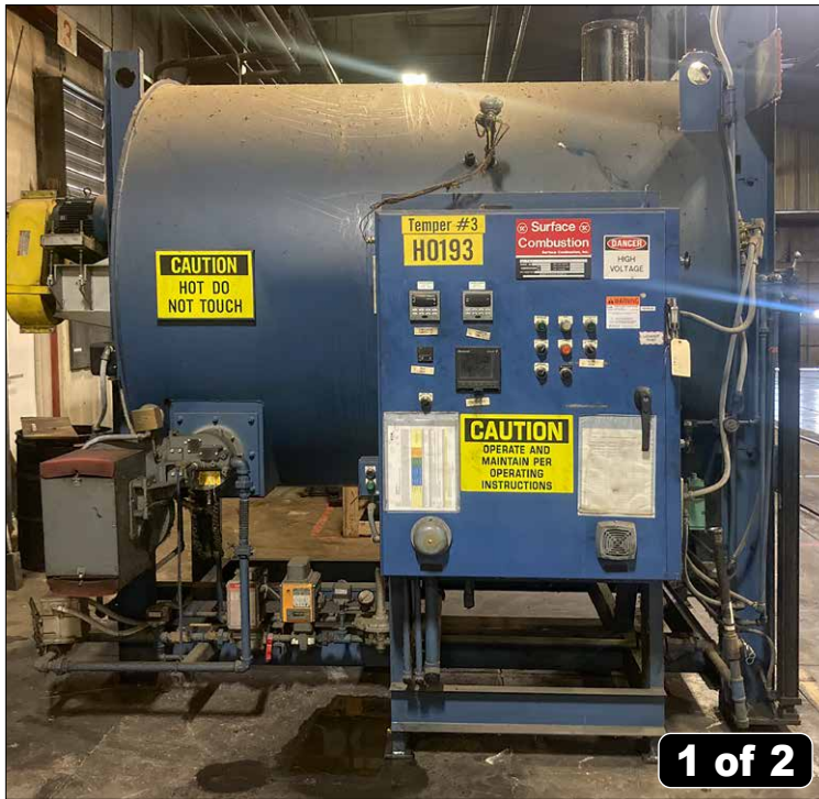
Surface Combustion Gas-Fired Uni-Draw Temper Furnace

JENSEN INDUSTRIES GAS-FIRED BATCH OVEN; Serial # 6682-02; 72" Wide x 72" Deep x 72" High; 460V, 3-Phase, 60 Hz, 60 Amps; 500-Degree F Max Temp; Natural Gas @ 1500 CFH; Nema 12 Control Panel; Honeywell Over Temp Control and Round Chart Recorder; Powered Exhaust; Front and Rear Doors, (Off Site, Please Contact Auctioneer for Information)