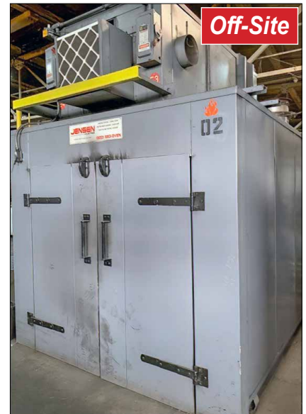
Jensen Industries Gas-Fired Batch Oven