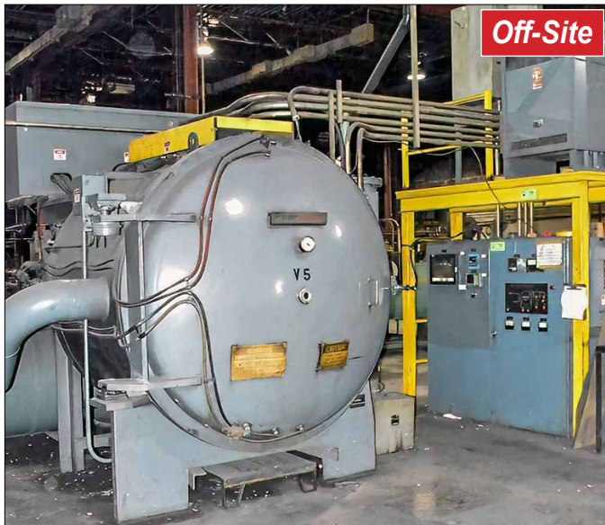
Abar Ipsen HR 50x48, 2 Bar Horizontal Vacuum Furnace