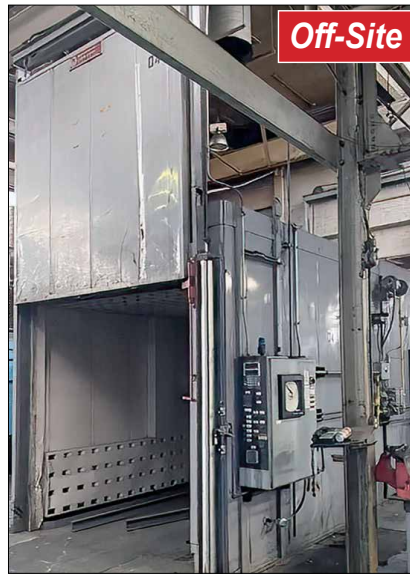
Wisconsin Oven Corporation EWN-820-8G Gas-Fired Batch Oven