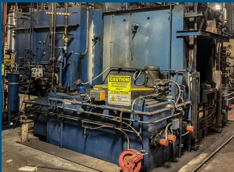
Surface Combustion AllCase Integrated Quench Furnace