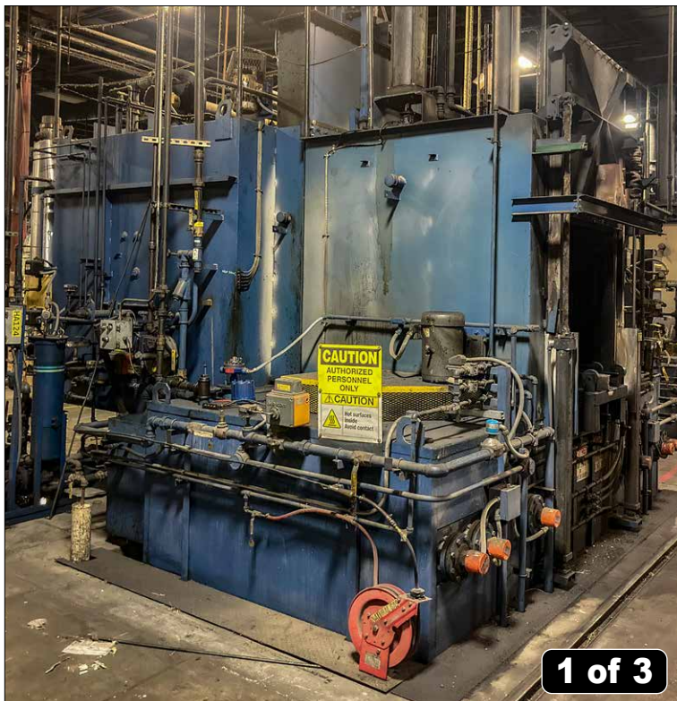
Surface Combustion Allcase Integral Quench Furnace