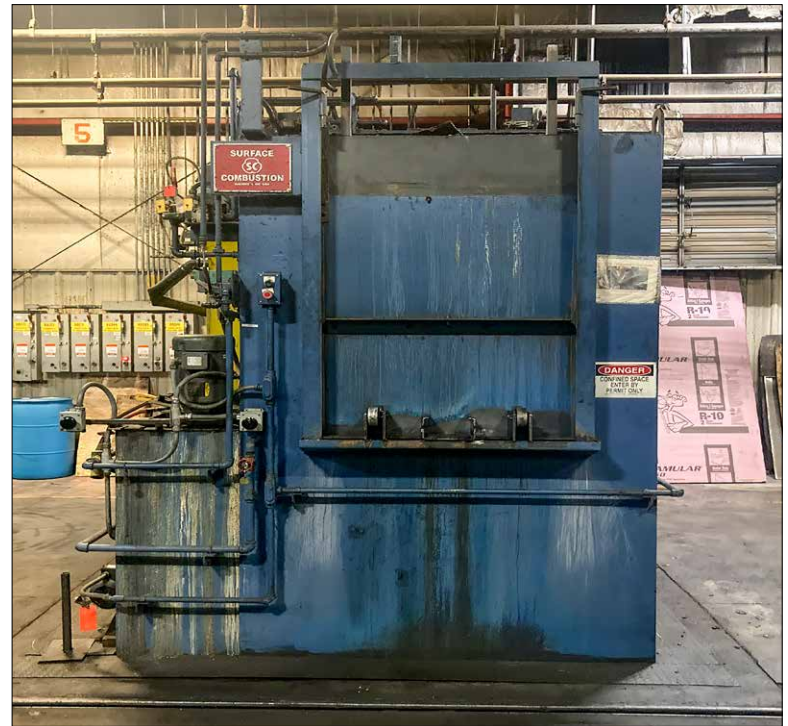
Surface Combustion Washer