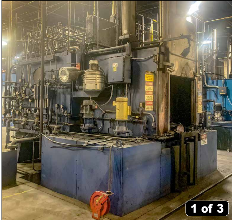
Surface Combustion Allcase Integral Quench Furnace

ABAR IPSEN BATCH TEMPER FURNACE; Model 1DL-30x36-G; 36" Wide x 48"