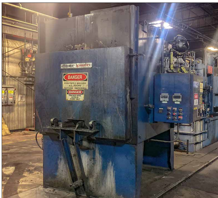
Abar Ipsen Batch Temper Furnace