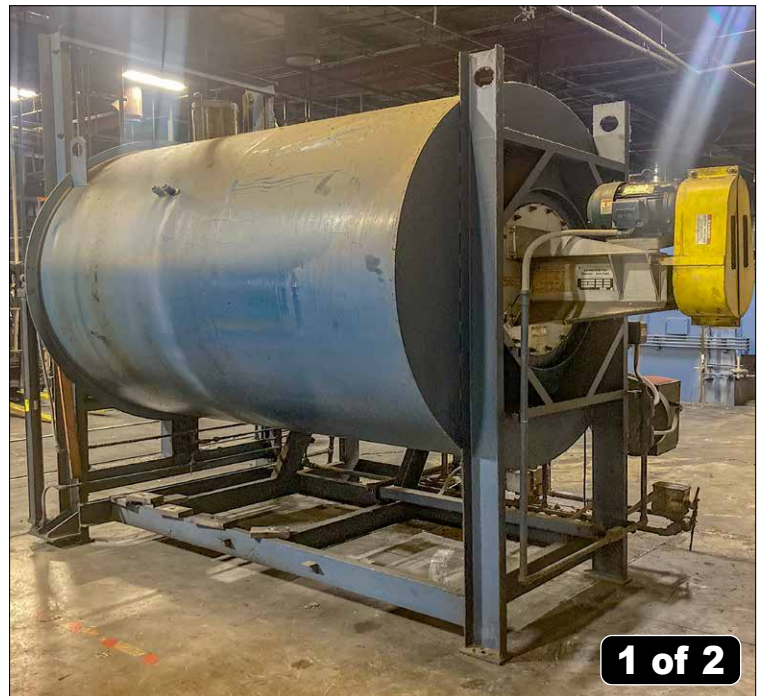
Surface Combustion Gas-Fired Uni-Draw Temper Furnace