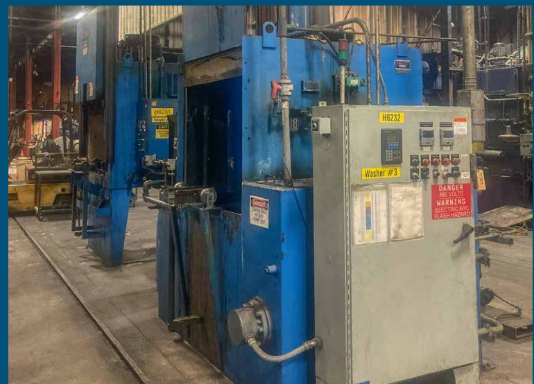
Abar Ipsen Model HR-3000-S SDA Washer