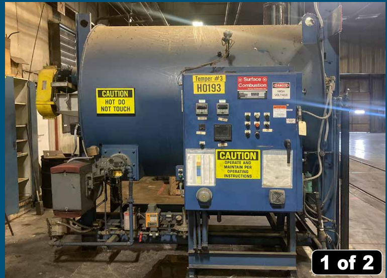
Surface Combustion Gas-Fired Uni-Draw Temper Furnaces