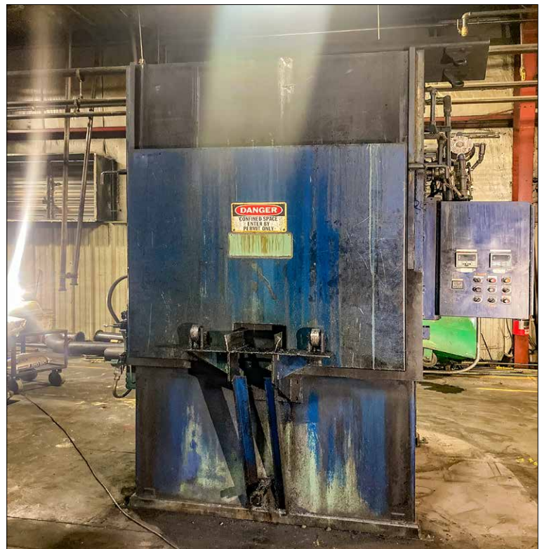
Ipsen Batch Temper Furnace