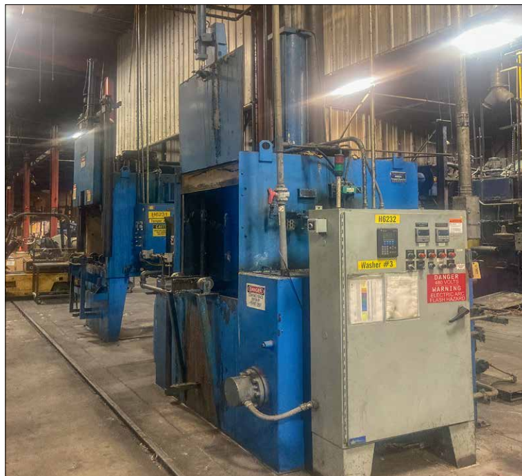
Abar Ipsen SDA Washer