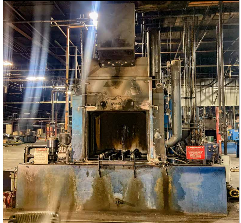
Abar Ipsen Integral Quench Furnace