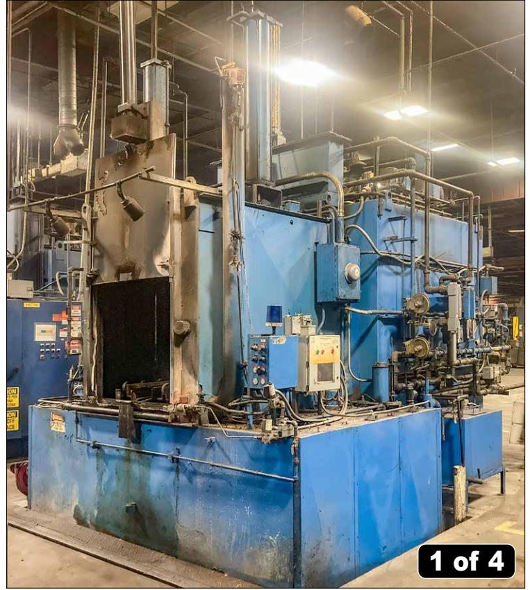
Ipsen Batch Temper Furnace