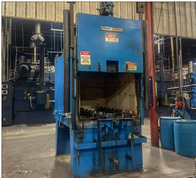
Abar Ipsen Electric Nitrogen Batch Temper

SBS HEAT EXCHANGER; 72" x 36" x 2.0" inlet/outlet; 100 MAWP@450-Degree F; Serial # 4095 (U3827c); Year 2004