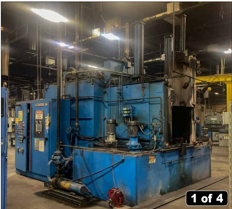
Ipsen Integral Quench Furnace