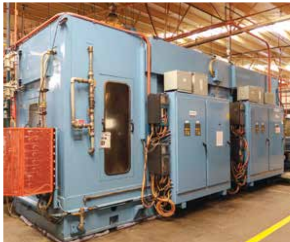
Nagel Precision Inc. 12PV-T Production Honing Machine