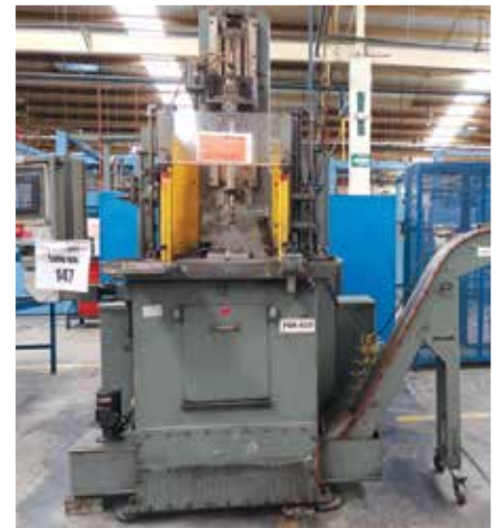
BMS 3-Ton Vertical Broach