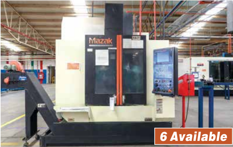
Mazak Model Smart 430A Vertical CNC Vertical Machining Center