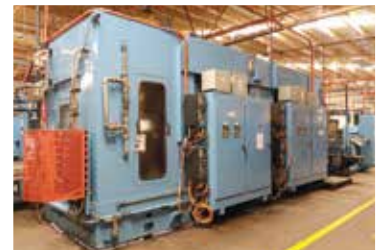
Nagel Precision Inc. Honing Machine

ROBERT LEVY ASSOCIATES, LLC CAPITAL ASSET MANAGEMENT DONE RIGHT