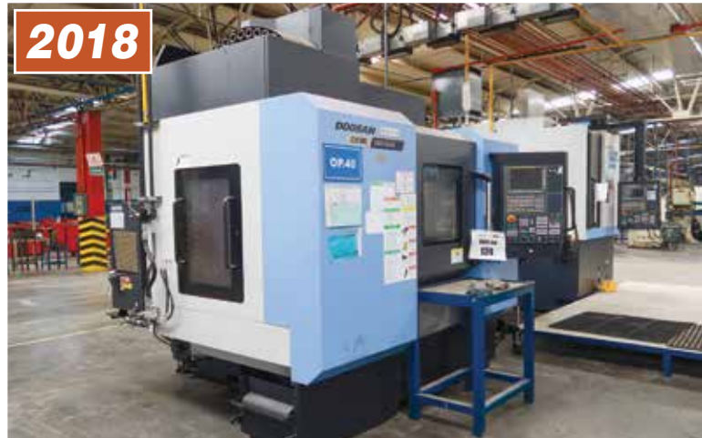
Doosan Model DNM 200/5AX CNC Vertical Machining Center