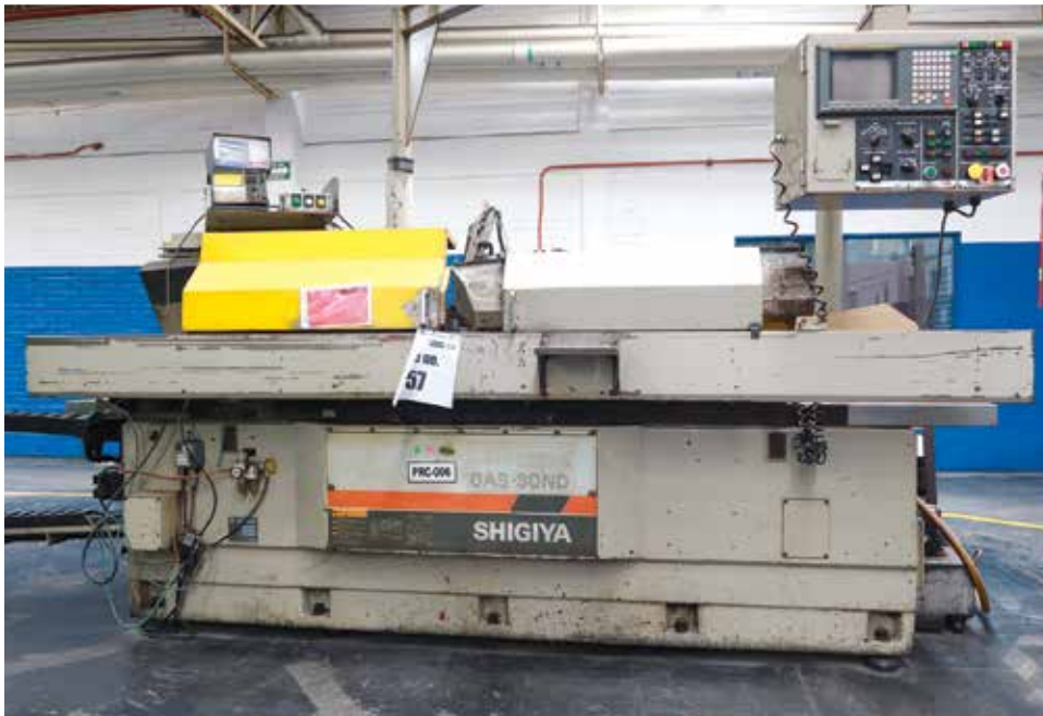
Shigiya Model GAS-30ND CNC Angular Cylindrical Grinder