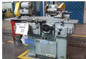
B&S Universal Tool Grinder