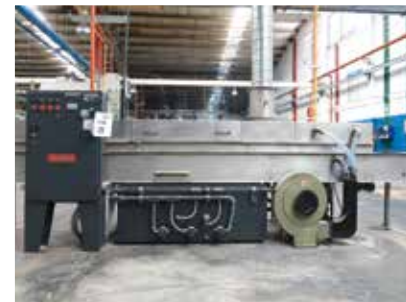
Almco Model PWB18 Pass Through Parts Washer