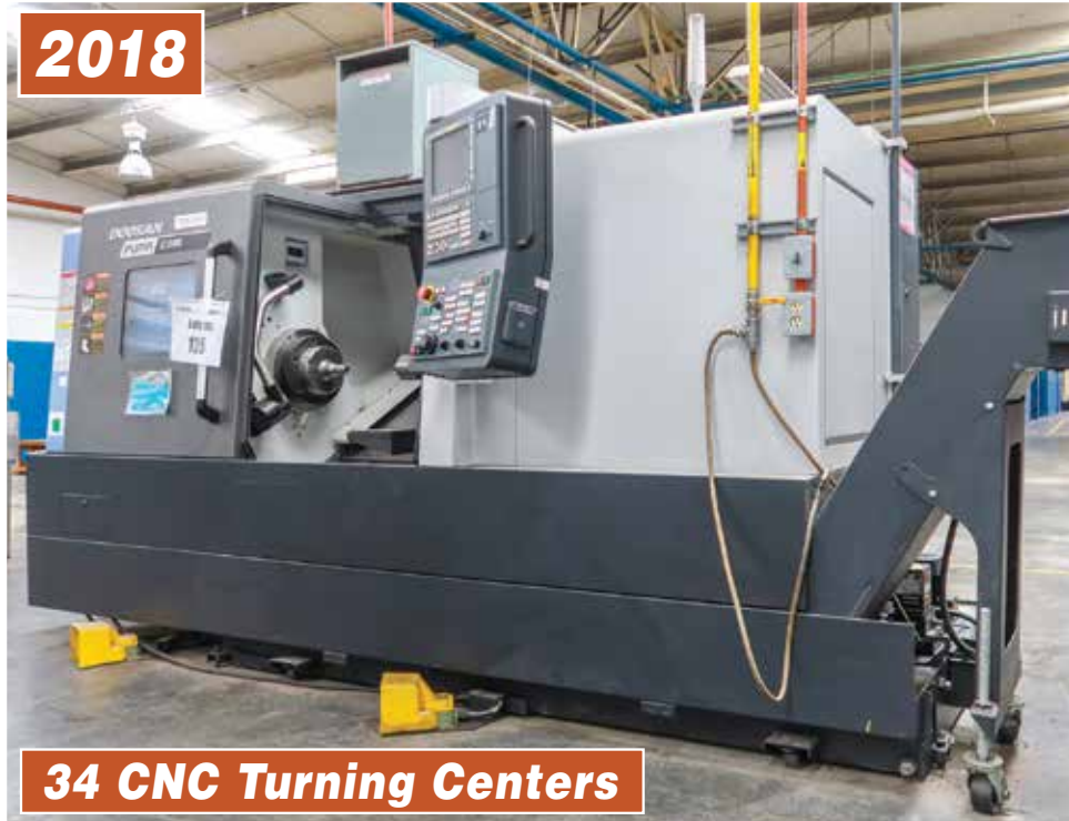
Doosan Model Puma GT3100 CNC Turning Center