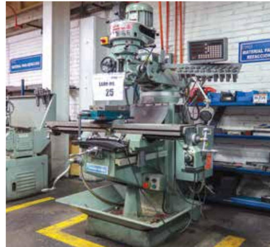
Birmingham (Mclane) X6323B Vertical Milling Machine