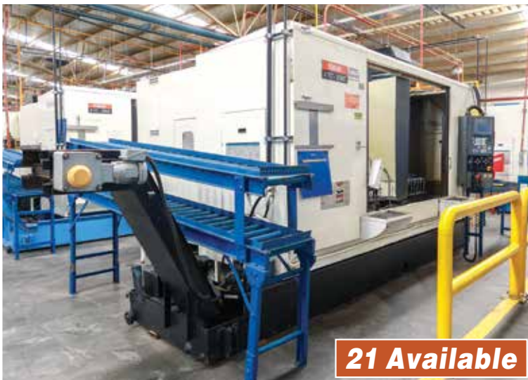
Mazak Model VTC-200C CNC Vertical Machining Centers

INCLUDING: (82) CNC Turning and Machining Centers – Grinders – Toolroom – Balancers – Hones – Quality Control – Shop & Factory – Equipment As New As 2019