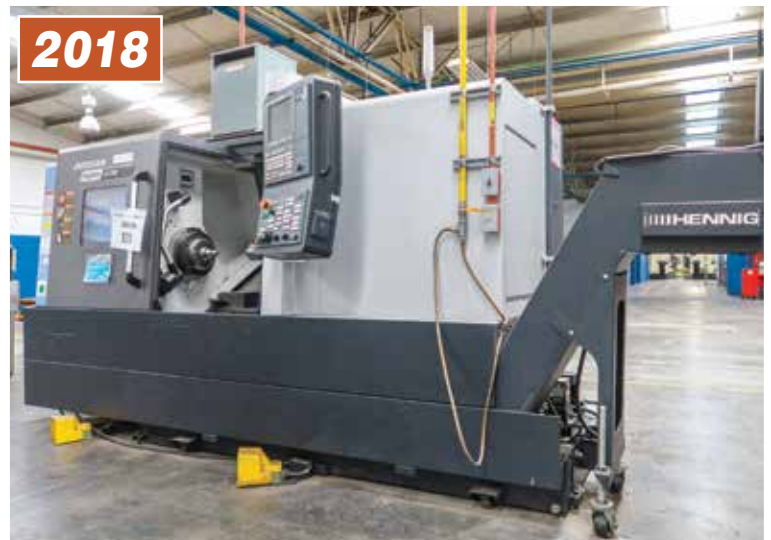
Doosan Model Puma GT3100 CNC Turning Centers

INSPECTION: Tuesday & Wednesday, May 24 & 25 or By Appointment