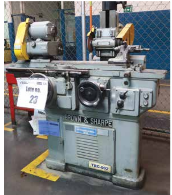
Brown & Sharpe No. 13 Universal Tool Grinder