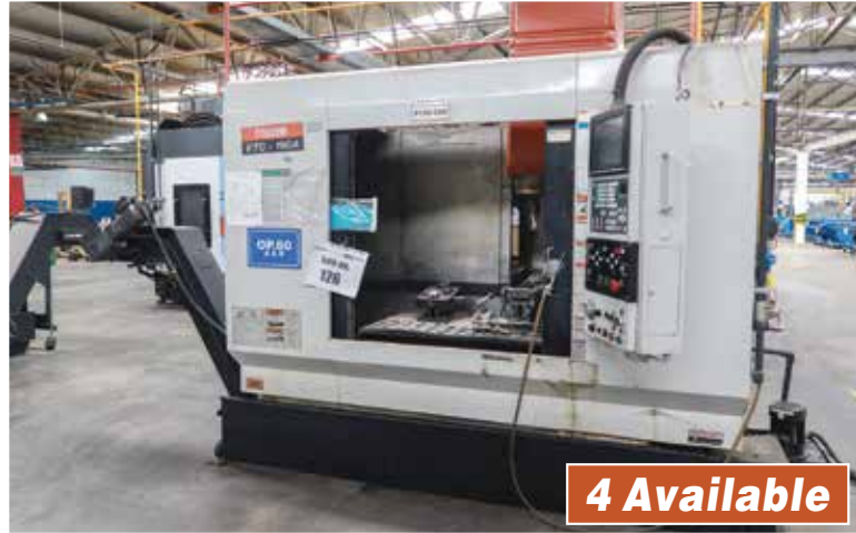
Mazak Model VTC-160A CNC Vertical Machining Center