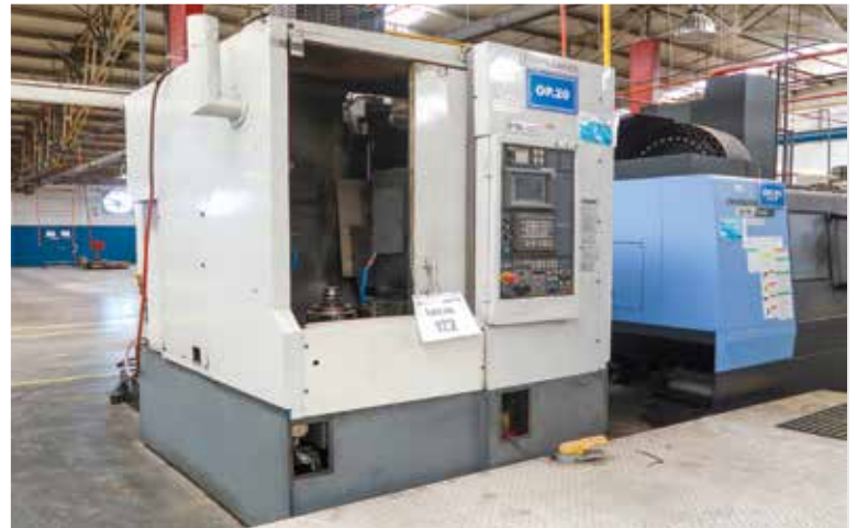
Mori Seiki Model VL-25 CNC Vertical Turning Center