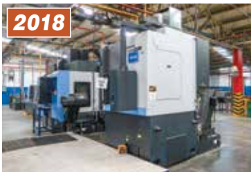
Doosan CNC Vertical Turning Center