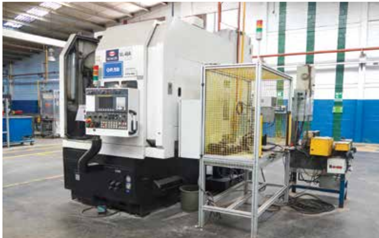
Honor Seiki Model VL-46A CNC Vertical Turning Center