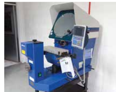
Mitutoyo PH-A14 14" Optical Comparator