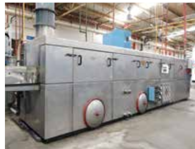
Hurricane Systems Model 5018 W/R/BO Pass-Through Parts Washer