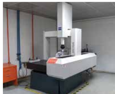
Zeiss Spectrum 7/10/6 RDS CMM