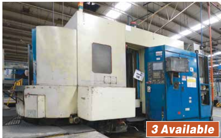
Toyoda Model FA550II CNC Horizontal Machining Center