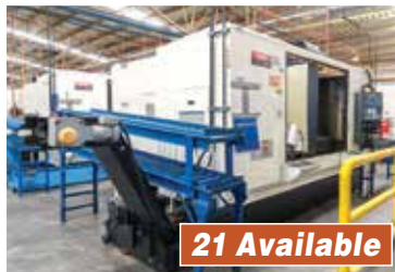
Mazak Vertical CNC Machining Center