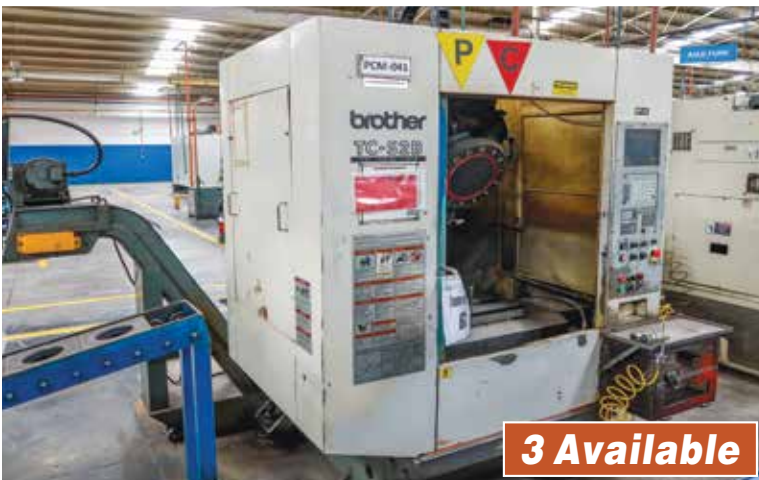
Brother Model TC-S2B CNC Drilling & Tapping Center