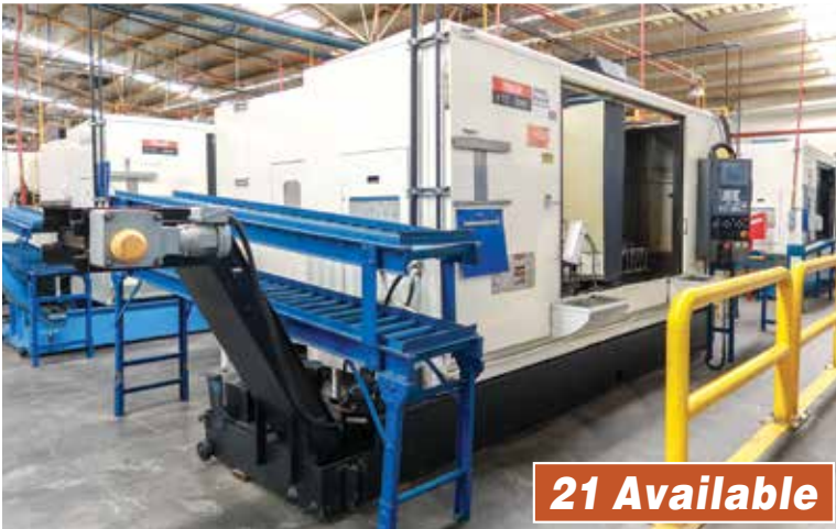
Mazak Model VTC-200C CNC Vertical Machining Center