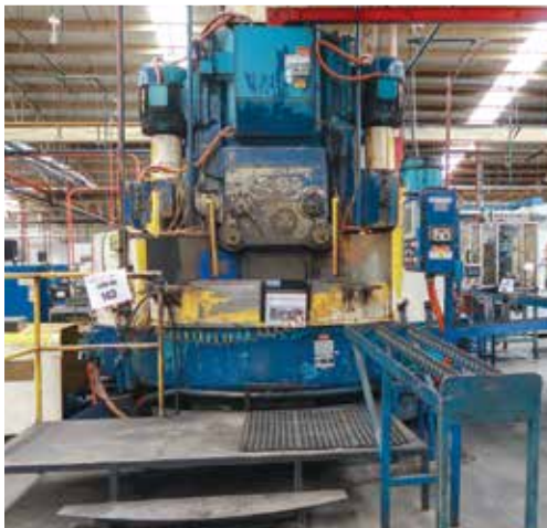
Mattison Machine Works Rotary Surface Grinder