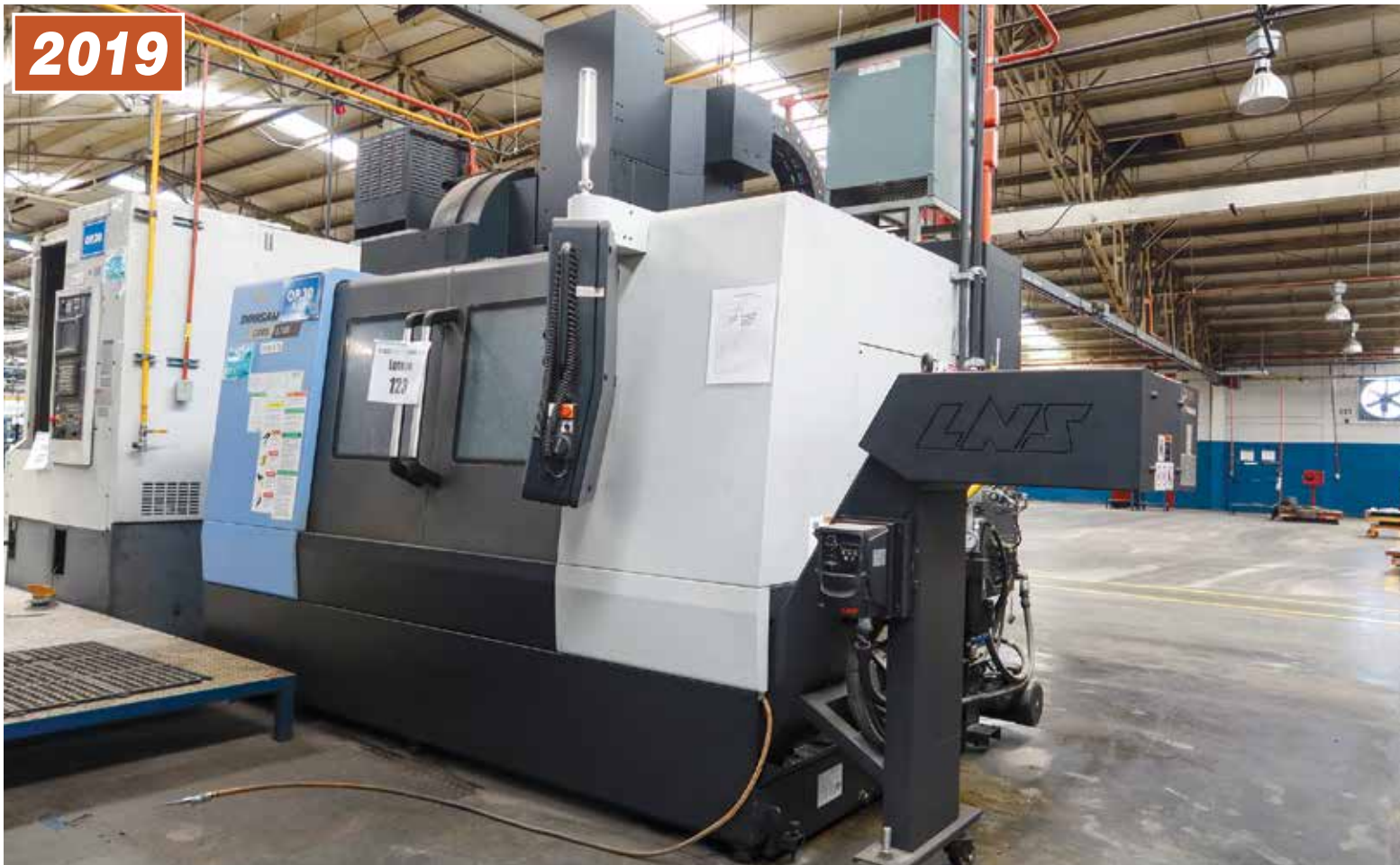
Doosan Model DNM 5700 CNC Vertical Machining Center