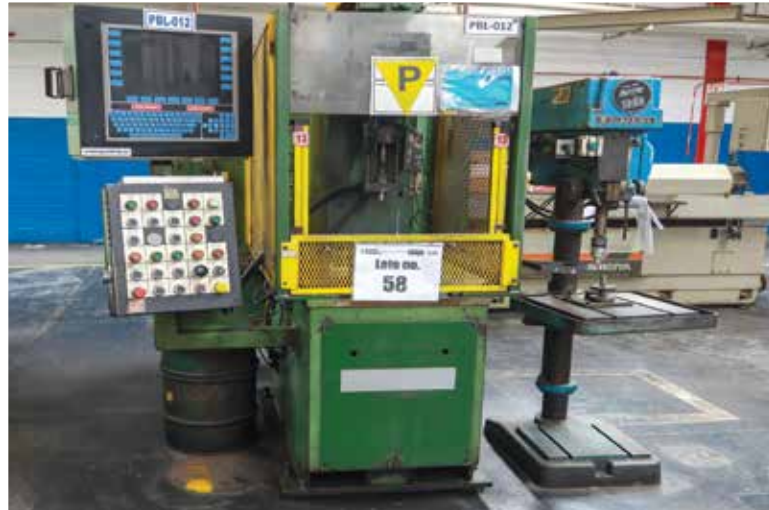
Balance Engineering Model Alpha IOP Balancer