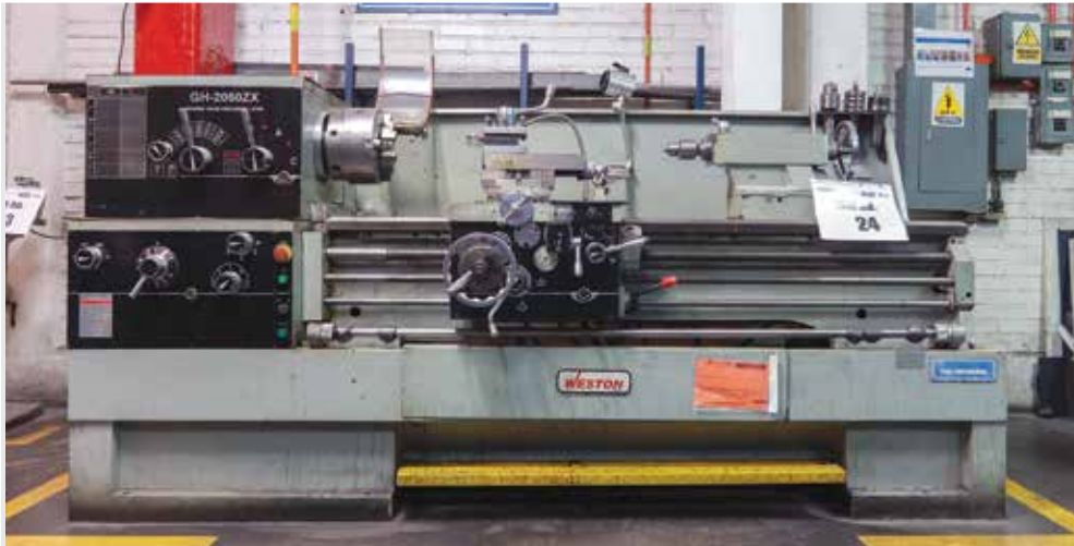
Weston Model GH-2060ZX 20" x 60" Geared Head Engine Lathe