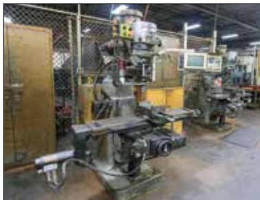
Bridgeport EZ Trax CNC Mill