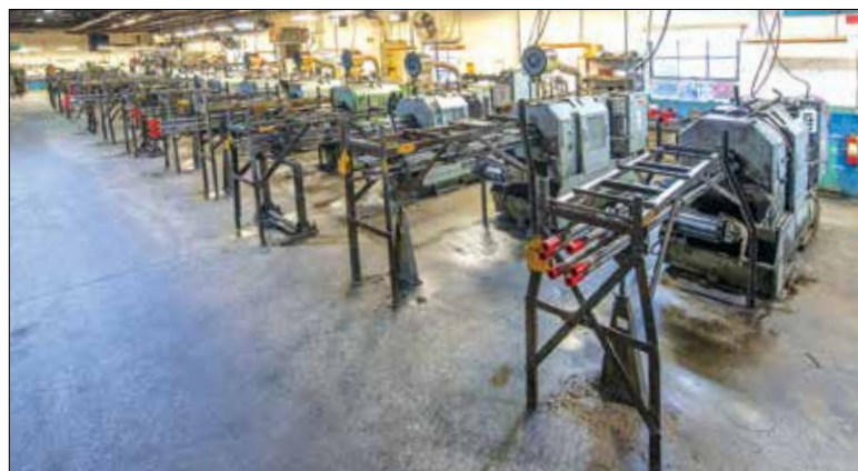
View of New Britain & National Acme Gridley Automatic Bar Machines

NATIONAL ACME GRIDLEY MODEL RN-6 5/8" 6 SPINDLE AUTOMATIC BAR MACHINE , S/N FC-16117, Cross Slides 6, 1, 3, 4, 5th Position Pick Off & Back Finishing Attachment, 4th Position Acme Style Universal Threading Attachment, Logan High/Low Feed Clutch (Machine #13)