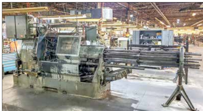
National Acme Gridley Model RB-8 1-1/4" 8 Spindle Automatic Bar Machine