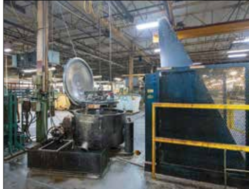
Tolhurst Vestil Chip Reclamation System

SUNNEN MBB-1680 POWER STROKE PRECISION HONE, S/N 51424, Tooling