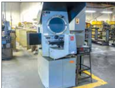
J&L Epic 14T Optical Comparator