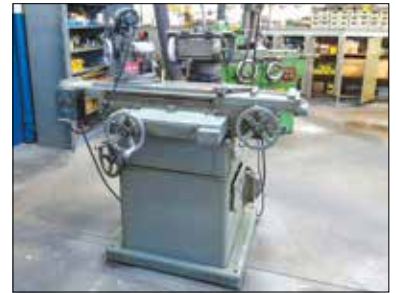
Hybco 2100-SB Tool & Cutter Grinder