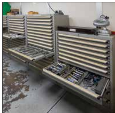
Pin & Thread Gages

LARGE QUANTITIES OF SCREW MACHINE TOOLING, ATTACHMENTS, CAMS, CHANGE GEARS, THREAD ROLLERS, CLUTCHES, PICK OFF & BACK FINISH, ROTARY RECESS & MILLING ATTACHMENTS, ACCELERATED REAMING AND THREADING