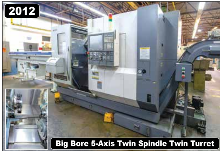
Okuma LT2000-EX-2T2MY Twinstar Big Bore 5-Axis CNC Slant Bed Turning Center