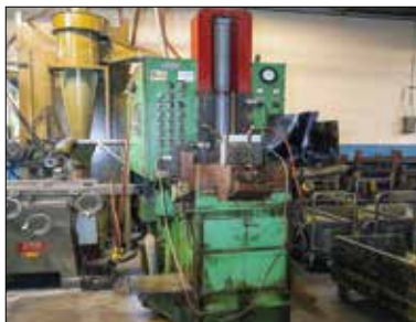
Ohio Broach VS536TB Vertical Broach