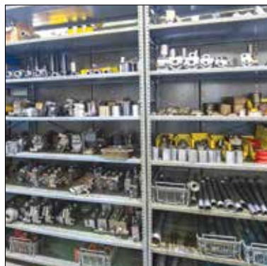
Screw Machine Tooling