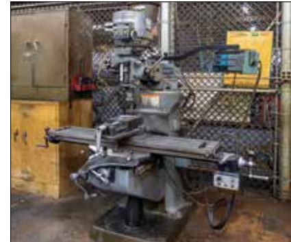
Bridgeport Series 1 Var. Speed Vertical Mill