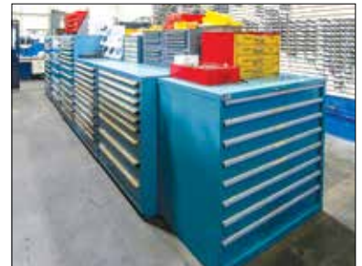
View of Vidmar Cabinets