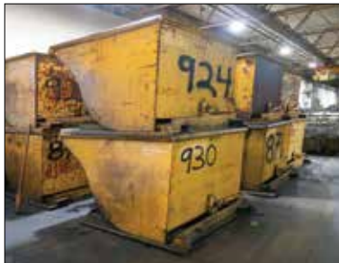
Self Dumping Hoppers