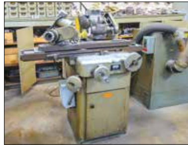
KO Lee Tool & Cutter Grinder