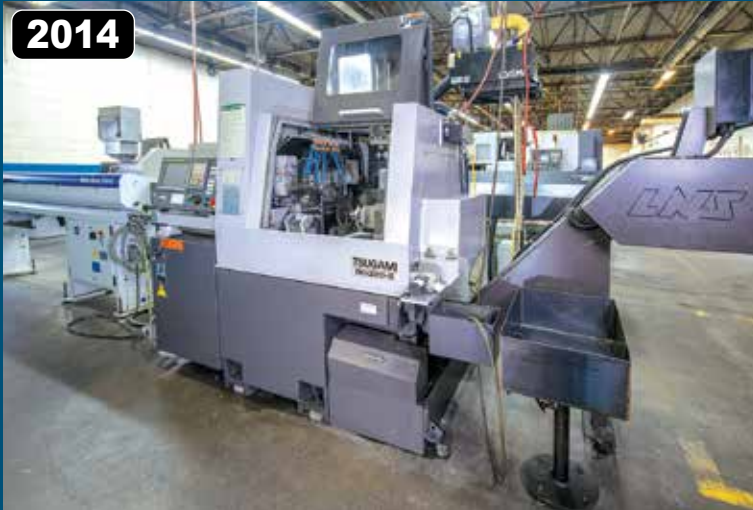
Tsugami B0326-II 32mm 6-Axis Swiss Type CNC Automatic Lathe