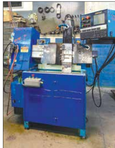
OmniTurn Model GT-JR 5HP CNC Gang Type Turning Center

HARDINGE MODEL OMNITURN DV-59 CNC GANG TYPE TURNING CENTER , S/N 2198G24, Tag #6501