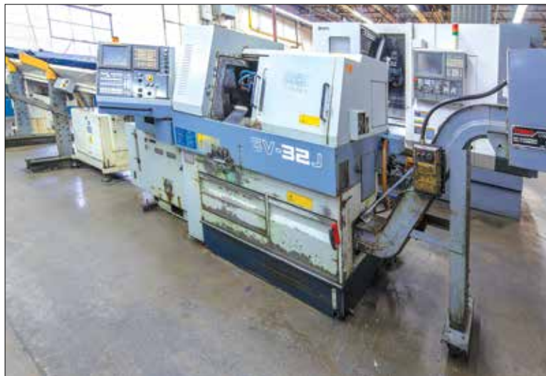
Star SV-32J Swiss CNC Turning Center