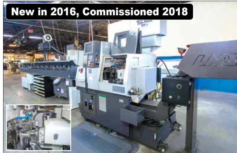
Tsugami B0206-III 20mm 6-Axis Opposed Gang Tool Swiss Type CNC Automatic Lathe