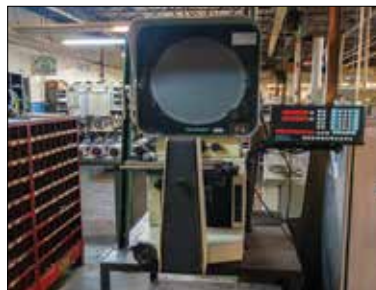
Deltronic DH-214 Optical Comparator