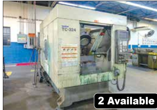
Brother CNC Drilling Milling & Tapping Machine