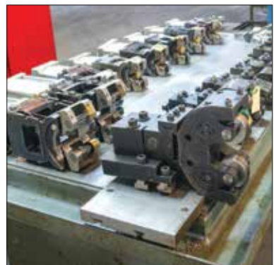
Thread Rollers & Rotary Recess Heads