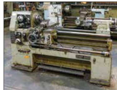
Sharp Model 1640H Toolroom Lathe