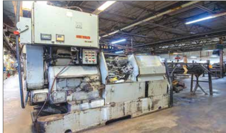
Acme Gridley Model RAN-6 1" 6 Spindle Automatic Bar Machine