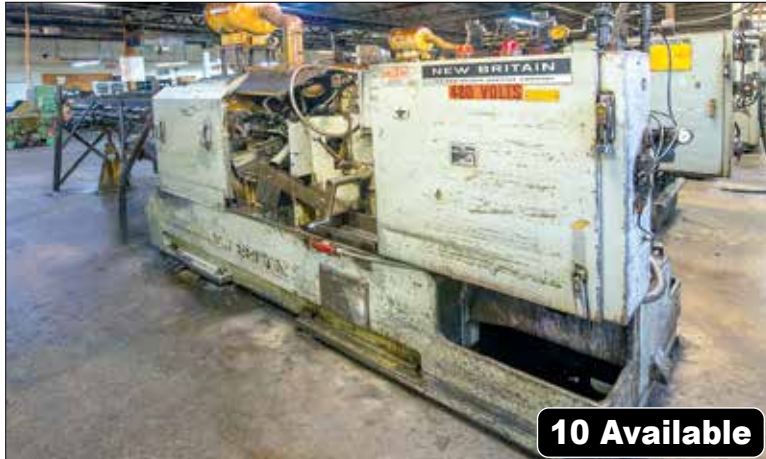
New Britain Model 51 1" 6 Spindle Automatic Bar Machine