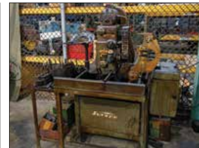
Sunnen Power Stroke Precision Hone