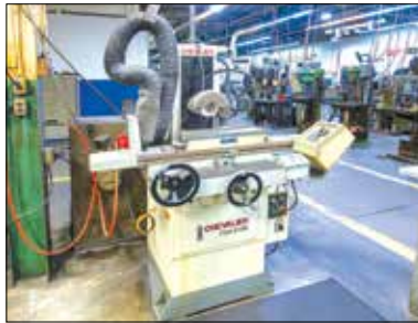
Chevalier FSG-618M Surface Grinder

CHEVALIER FSG-618M HAND FEED SURFACE TOOL & CUTTER GRINDER , Walker 6"x 18" Electromagnetic Chuck, O.S. Walker Smart Chuck Control, Tag #1725 BOYAR SCHULTZ CHALLENGER 612 DELUXE 6" X 12" HAND FEED SURFACE GRINDER , S/N 17512, Permanent Magnetic Chuck, Tag #1726 BOYAR SCHULTZ H-612 6" X 12" HAND FEED SURFACE GRINDER , Tag #1685 (3) BOYAR SCHULTZ 6" X 12" SURFACE GRINDERS , S/N 26343, Tag #1555, 1728, 1683 BROWN & SHULTZ NO. 13 UNIVERSAL TOOL & CUTTER GRINDER , S/N 525-13-2881, (Tag #1574) KO LEE TOOL & CUTTER GRINDER , Tag #1559 HYBCO 2100-SB TAP GRINDER , S/N RF102, Tag #1552 HYBCO TAP GRINDER , Tag #1724 RUSH 250A DRILL GRINDER , S/N 1106, Tag #1502 GIDDINGS & LEWIS EXACTIMATIC DRILL POINT GRINDER , Tag #1687 NUMEROUS DUSTKOP DUST COLLECTORS