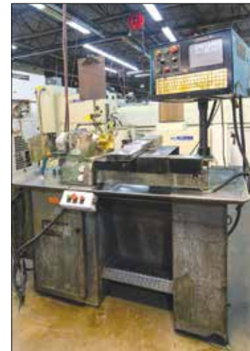
Hardinge Model OmniTurn DV-59 CNC Gang Type Turning Center

Please visit www.rlevyinc.com and www.bid.orbitbid.com/auctions for comprehensive sale details, terms & conditions & updated listing of all assets to be sold.