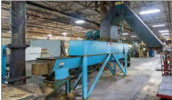
Prab Chip Loader Conveyor System