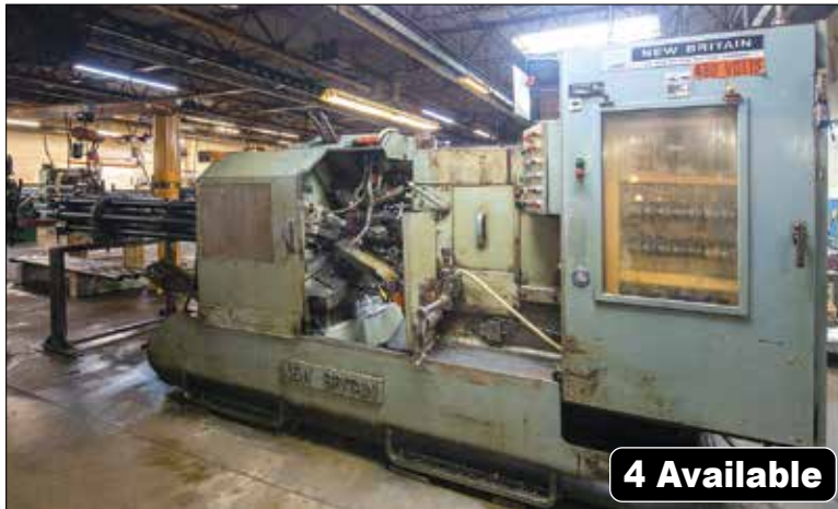
New Britain Model 62 2-1/4" 6 Spindle Automatic Bar Machine

NEW BRITAIN MODEL 51 1" 6 SPINDLE AUTOMATIC BAR MACHINE, S/N 38420, 6 Cross Slides, Stock Reel & Stand Universal Chip Conveyor (Machine #7)