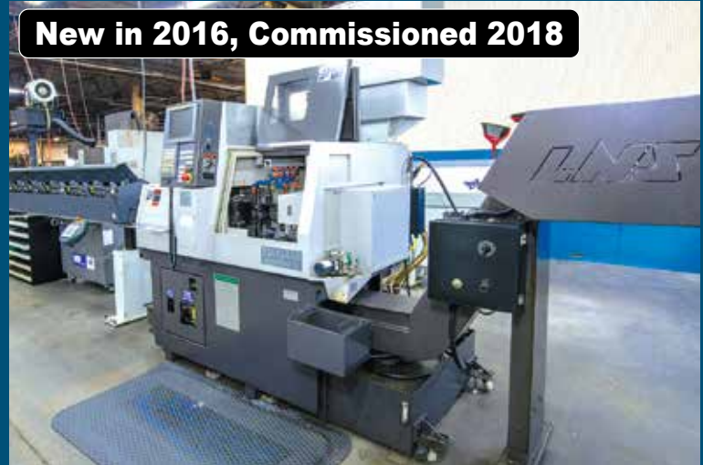
Tsugami B0206-III 20mm 6-Axis Swiss Type CNC Automatic Lathe

Featuring: CNC Tsugami & Okuma Turning Centers as Late as 2016; New Britain and National Acme Gridley Automatic Bar Machines; Brown & Sharp Automatic Screw Machines; Degreasers and Part Washers; Chip Reclamation and Handling; CNC Drilling, Milling and Tapping; Toolroom, Inspection and Shop Equipment