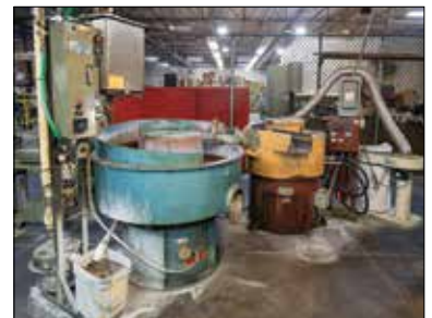
Vibratory Parts Finishers