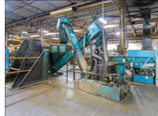
Mayfran Chip Reclamation System