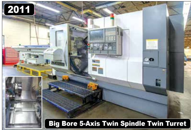
Okuma LT2000-EX-2T2MY Twinstar Big Bore 5-Axis CNC Slant Bed Turning Center