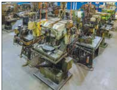
View of 2nd Op Department

SNOW TA-5RM SINGLE SPINDLE TAPPING MACHINE , S/N CO41677-1082 SUGINO DRILL UNITS , S/N SN4U-2-5700, Tag #6131-6132-6133-6134 SUNDSTRAND MILLING MACHINE , Tag #6602 OHIO BROACH VS536TB VERTICAL BROACH , S/N 28967-79, Tag #6202 BARKER SEMI-AUTOMATIC MILL MACHINE , S/N AM 1486 B, Tag #6616 UNIVERSAL AM 603 UNIVERSAL DRILLS CENTERLESS GRINDERS (3) ROSSI MONZI 300 CENTERLESS GRINDERS , S/Ns 70972, 52066 & 55868 VIBRATORY PARTS FINISHING SWECO RD8-3 VIBRATORY PARTS FINISHER , Tag #6125 PECO VIBRATORY FEED SYSTEM , S/N W15005, Tag #6113