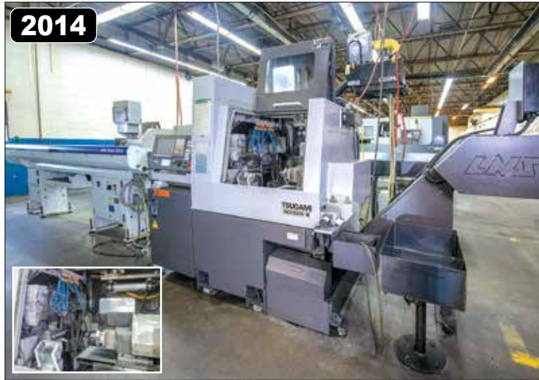
Tsugami B0326-II 32mm 6-Axis Swiss Type CNC Automatic Lathe

IEMCA BOSS 542 AUTOMATIC BAR LOADER & FEED , S/N 98072752 BAR FEEDS MAY BE SOLD SEPARATELY