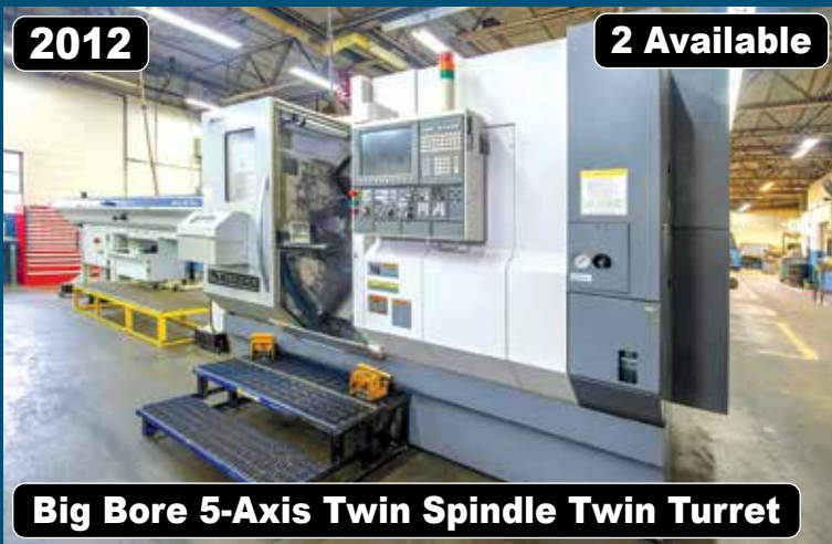
Big Bore 5-Axis Twin Spindle Twin Turret