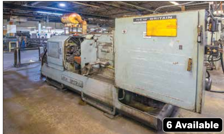
New Britain Model 52 1-1/4" 6 Spindle Automatic Bar Machine