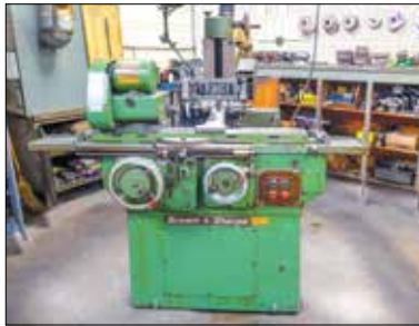
B&S No. 13 Universal Tool Grinder