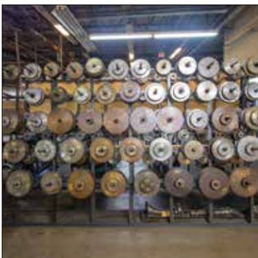
New Britain Change Gears