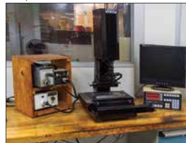
Views of Inspection, Quality Control & Lab Equipment