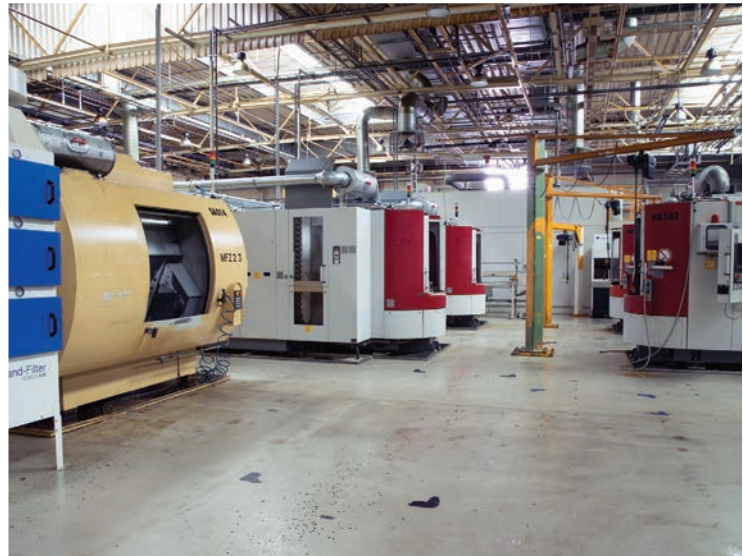
SAMAG & STARRAG-HECKERT CNC Machining Centers