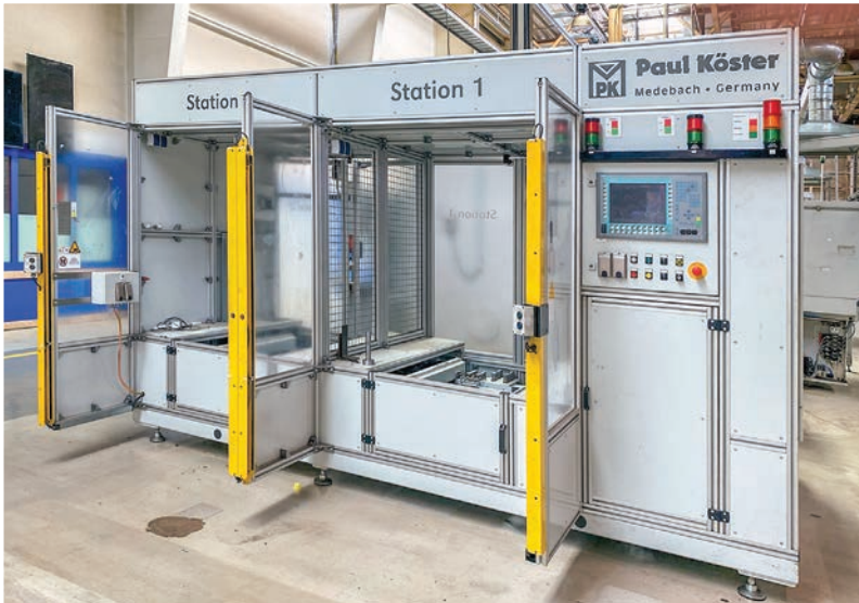
PAUL KÖSTER Leak Testing Station