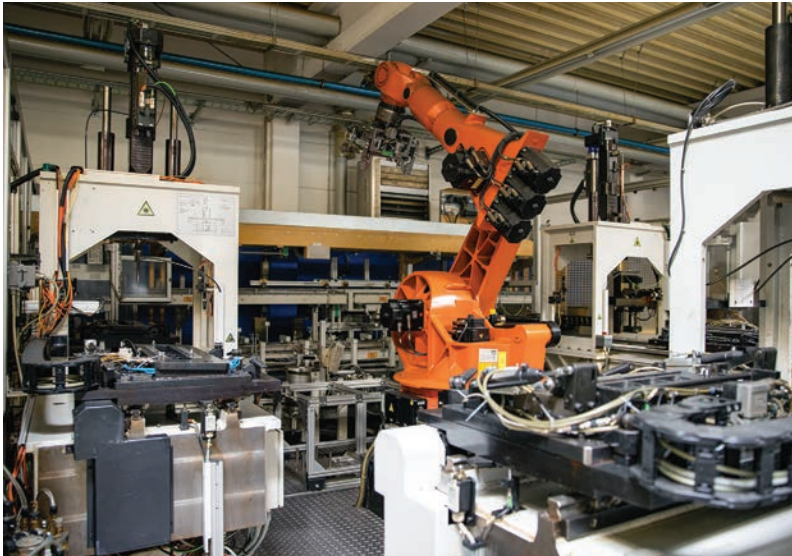
KUKA Robot Cylinder Head Assembly Station