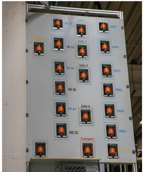
HELLER CNC Machining Cell Control Panel