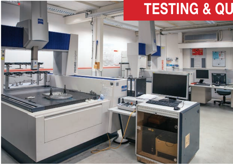
ZEISS Coordinate Measuring Machines