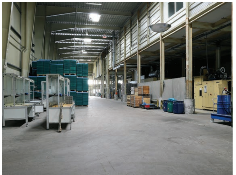
Intermediate Hall for Dispatching and Supplies