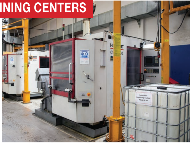
HECKERT CNC Machining Centers