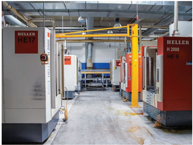
HELLER CNC Machining Centers with Crane