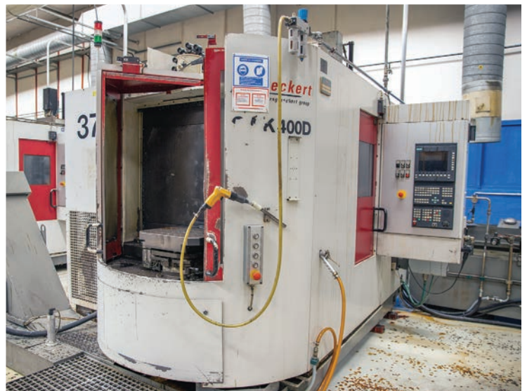
HECKERT CNC Machining Centers