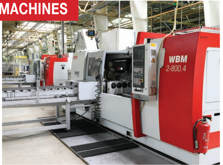
SAMAG CNC 4-Spindle Deep Drilling Machines