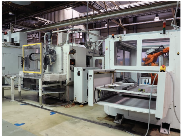
WMS Multi Functional Processing Unit (r) & SAMPUTENSILI Gear Hobber (l)