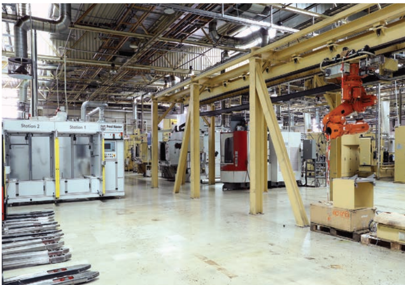
Parts Handling Portal with ABB Robot