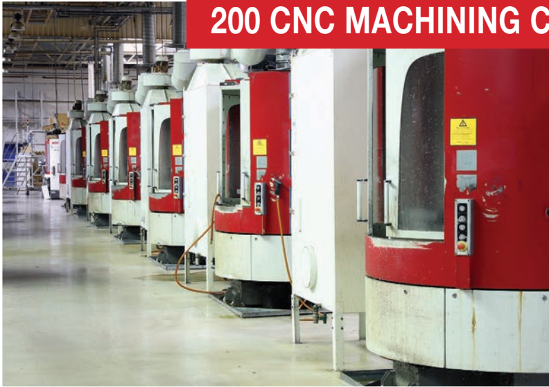
STARRAG-HECKERT CNC Machining Centers