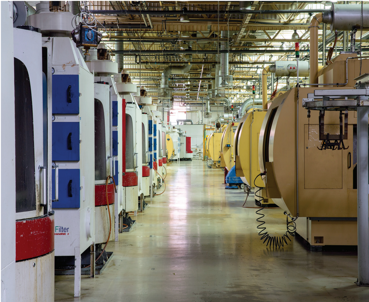
Partial View of SAMAG & STARRAG-HECKERT CNC Horizontal Machining Centers

CNC Machining Centers for Cubic Components Up to 800 x 1000 mm • CNC Machines with Working Spindles • Washing Machines • Leak Testing Machines • Grinders • Deep Drilling, Deburring, Honing, Con Rod Crackers, Marking and Heat Treat Robots • Cranes • QA Equipment • Factory Vehicles • Supply Systems • Large Quantities of Shop & Factory Tooling and Supplies • Premium Brands Include: SEMAG, HELLER, HECKERT, NAGEL, INDA, KUKA, DÜRR, PAUL KÖSTER