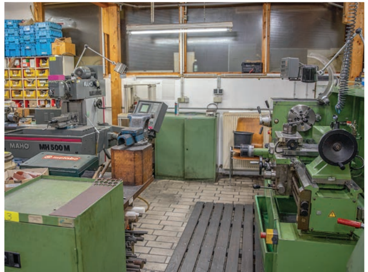
WEILER Lathe and MAHO Universal Mill