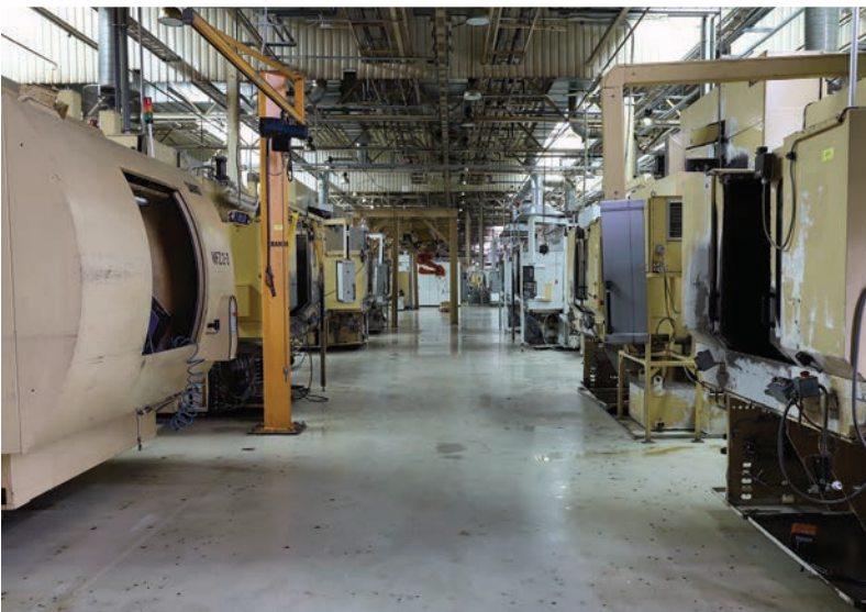
SAMAG and HONSBERG LAMB CNC Machining Centers