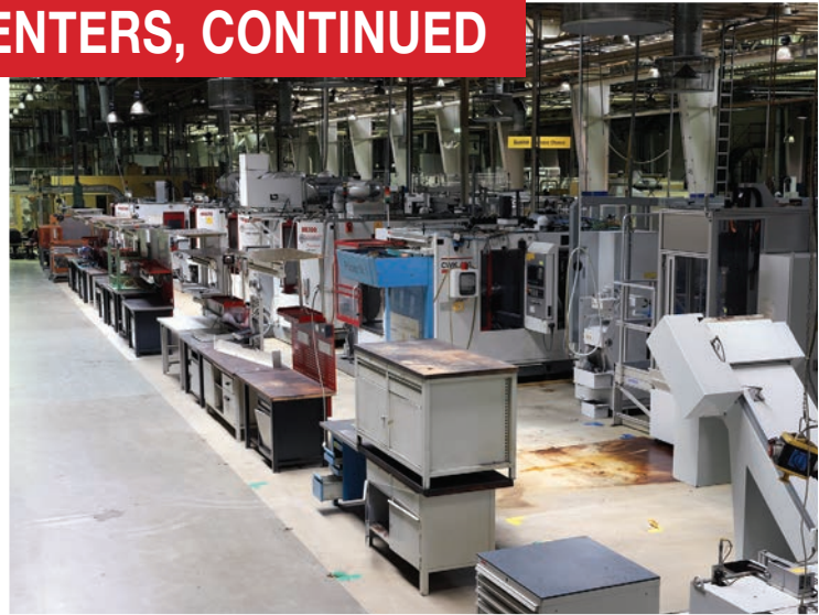
Overview of STARRAG-HECKERT CNC Machining Centers & Working Benches