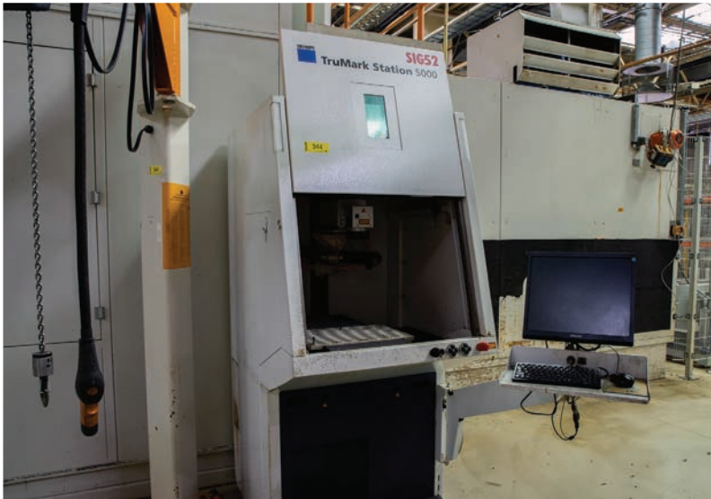
TRUMPF Marking Station