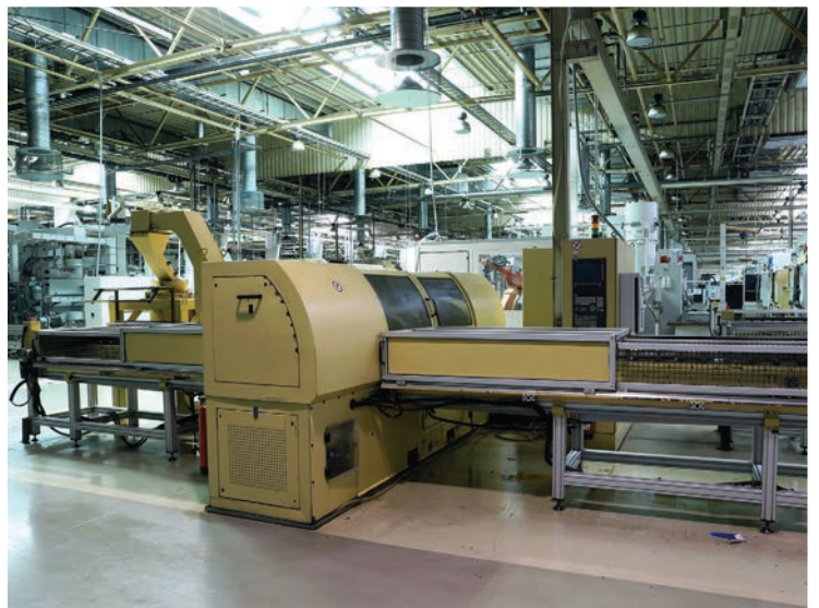
IXION CNC Deep Drilling Machine