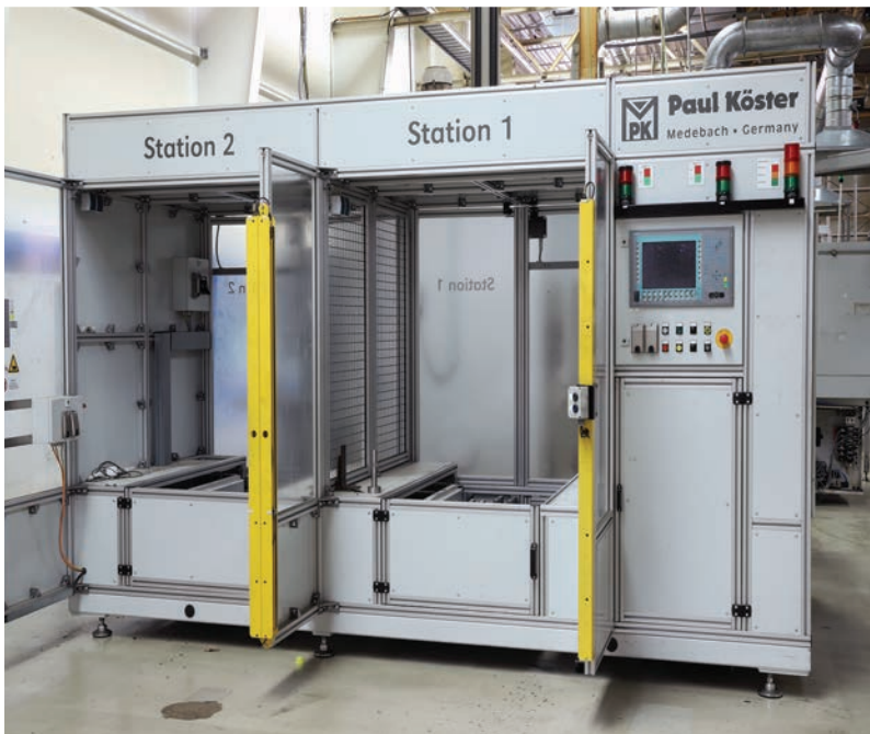
PAUL KÖSTER Leak Testing Machine