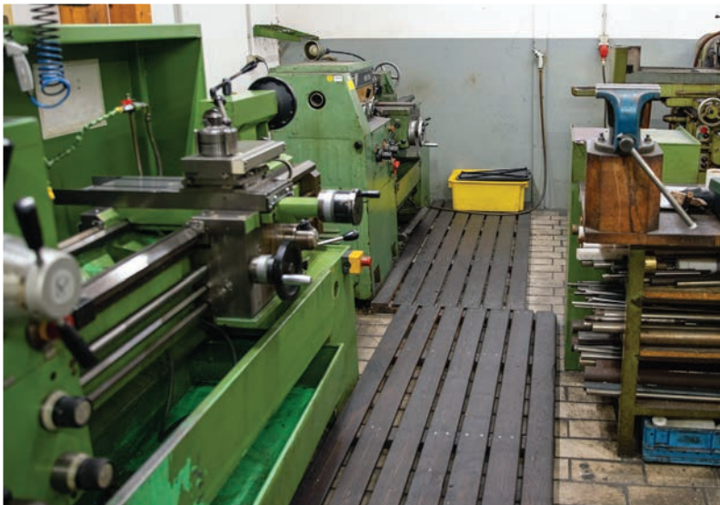
WEILER AND RECKORD Lathes