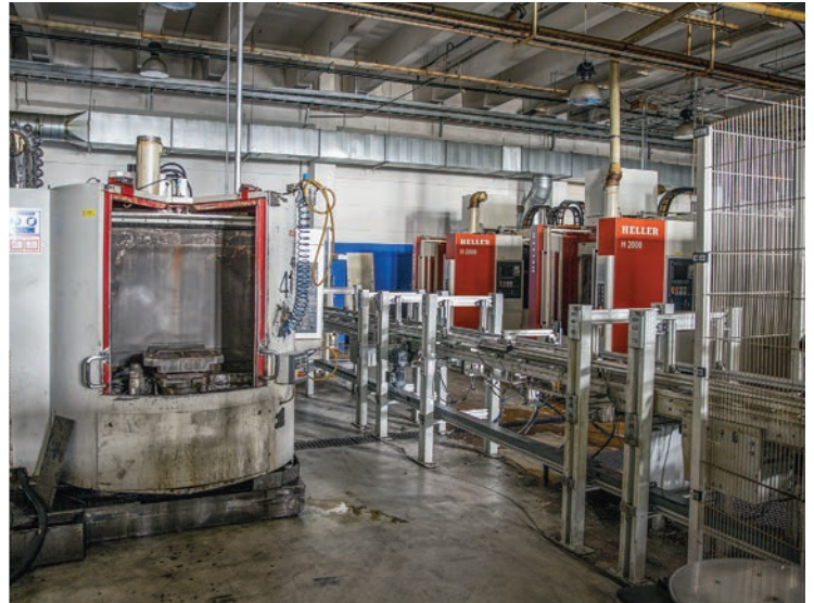
HECKERT & HELLER CNC Machining Centers & Conveyor System