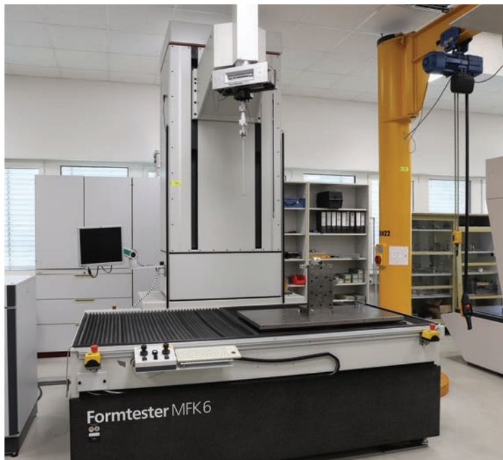
MAHR Form Measuring Center