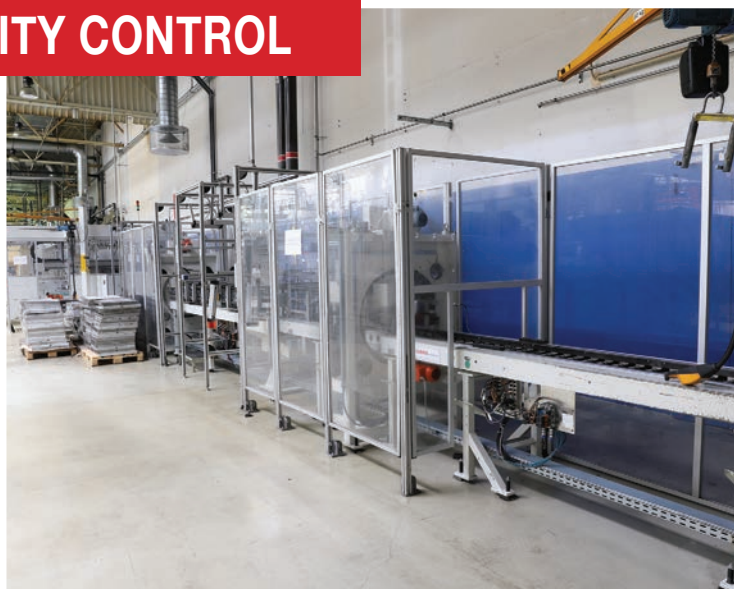
WERNER BAYER GmbH Core Plug Insertion, Leak Test & Identity Marking System