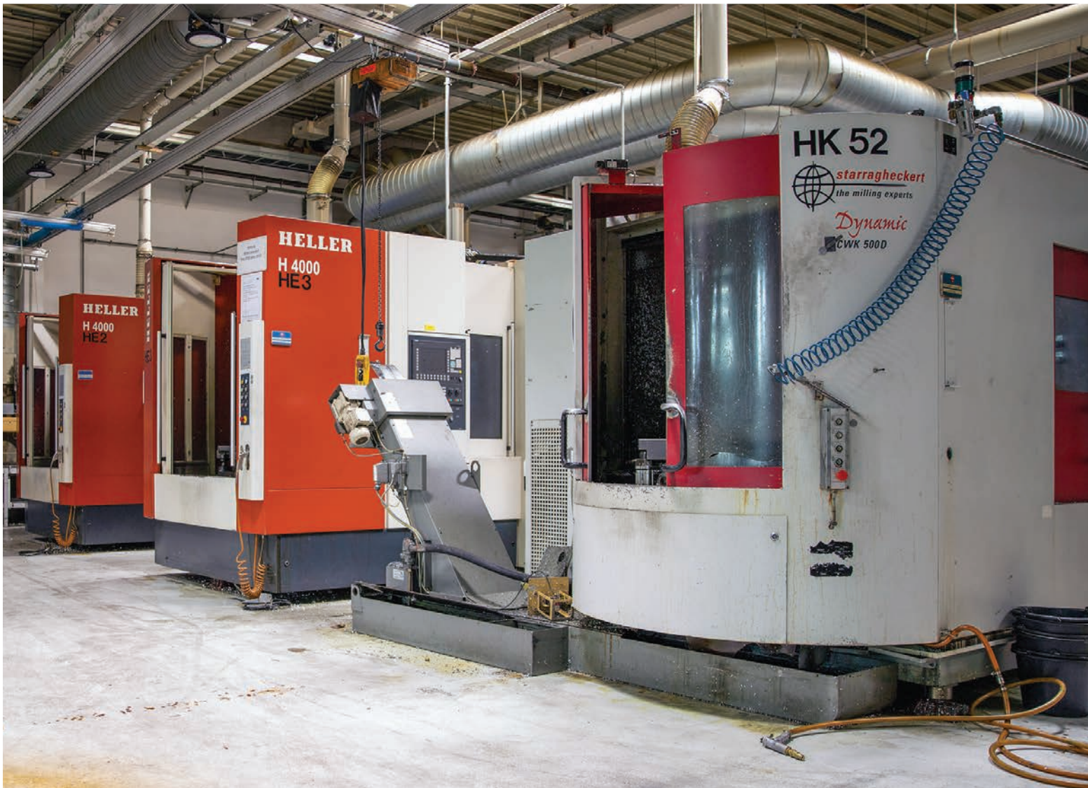
View of HELLER and STARRAG-HECKERT CNC Machining Centers

CNC Machining Centers for Cubic Components Up to 800 x 1000 mm • CNC Machines with Working Spindles • Washing Machines • Leak Testing Machines • Grinders • Deep Drilling, Deburring, Honing, Con Rod Crackers, Marking and Heat Treat Robots • Cranes • QA Equipment • Factory Vehicles • Supply Systems • Large Quantities of Shop & Factory Tooling and Supplies • Premium Brands Include: SEMAG, HELLER, HECKERT, NAGEL, INDA, KUKA, DÜRR, PAUL KÖSTER