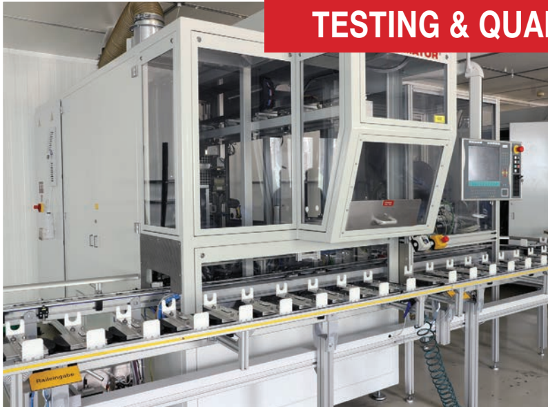
MAXIMATOR Leak Testing Machine with Conveyor Handling Module