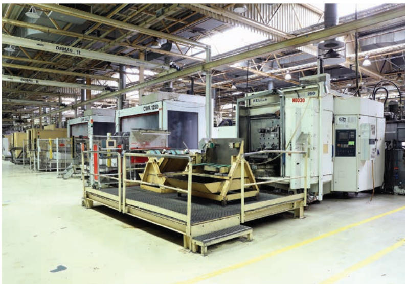
HELLER CNC Horizontal Machining Center with Head Changing System