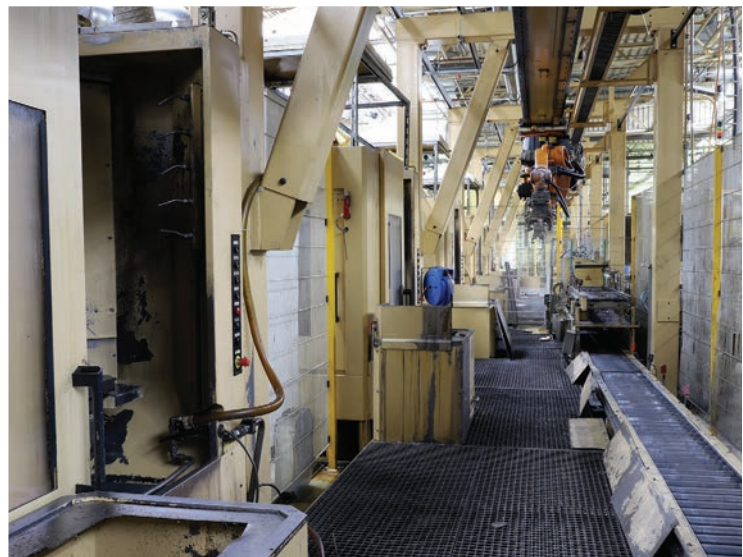
Chained CNC Machining Centers with Automated Loading/Unloading System