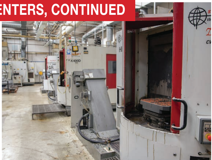
STARRAG-HECKERT CNC Machining Centers