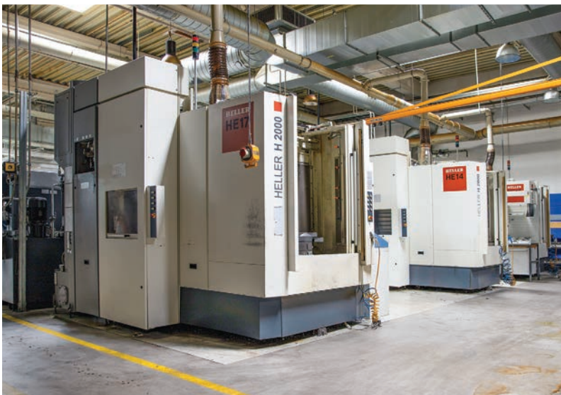
HELLER CNC Machining Centers