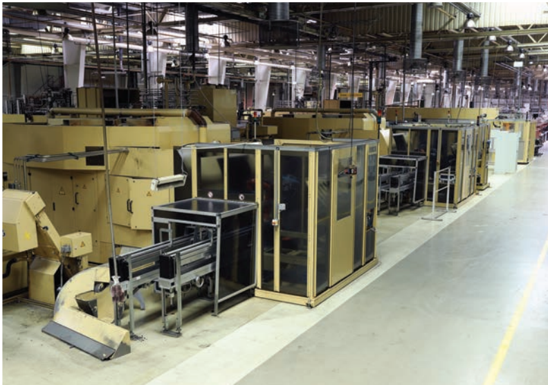
SAMAG CNC Horizontal Machining Centers with Loading Robots