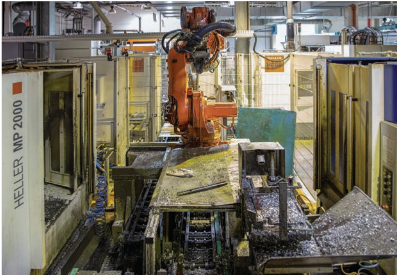
HELLER CNC Machining Cell with ABB Robots