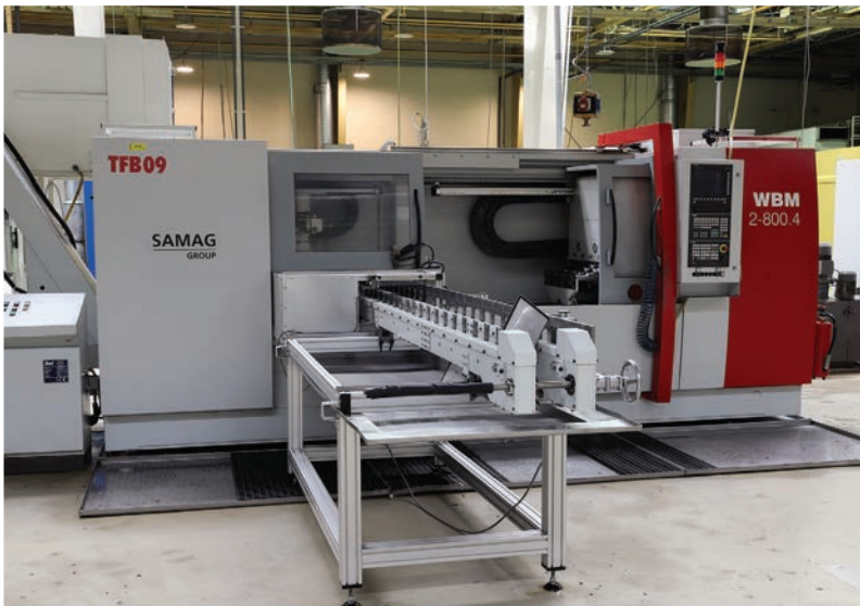
SAMAG CNC 4-Spindle Deep Drilling Machines