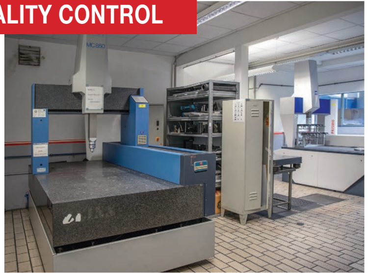
ZEISS Coordinate Measuring Machines