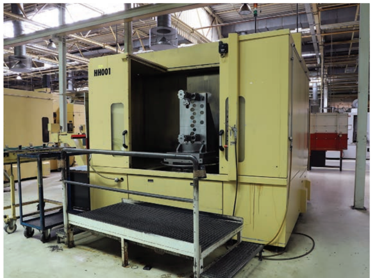
HUELLER HILLE CNC Horizontal Machining Center