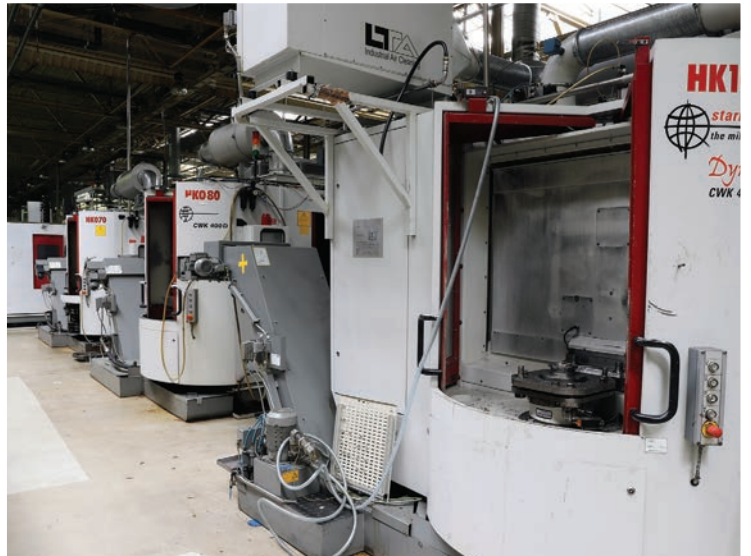
STARRAG-HECKERT CNC Machining Centers