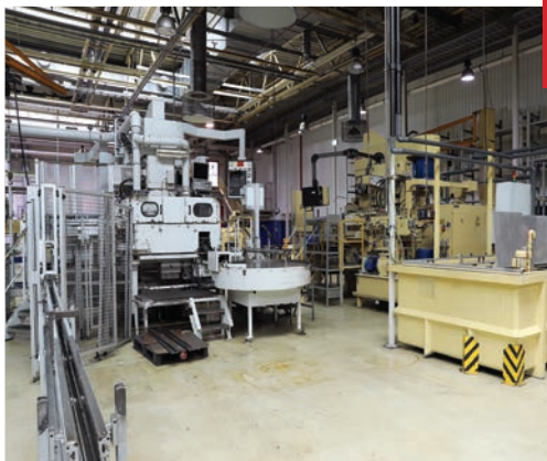
DISKUS Surface Grinding Machines