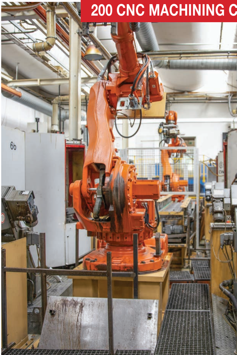
HECKERT CNC Machining Cell with ABB Robots