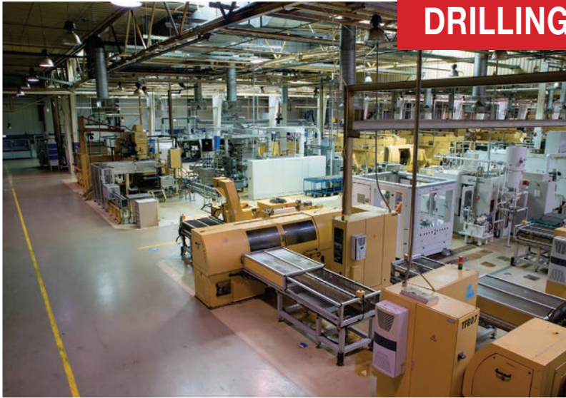
Overview of IXION CNC Deep Drilling Machines