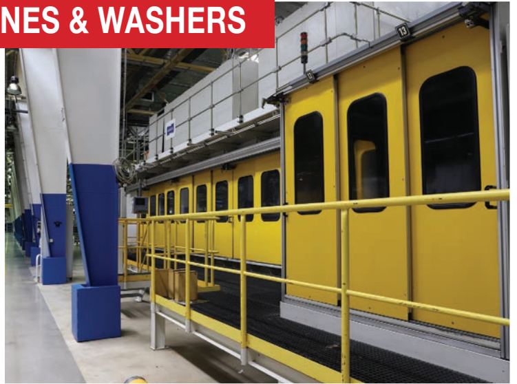
NAGEL 12-Spindle Transfer-Honing Machine for Engine Blocks