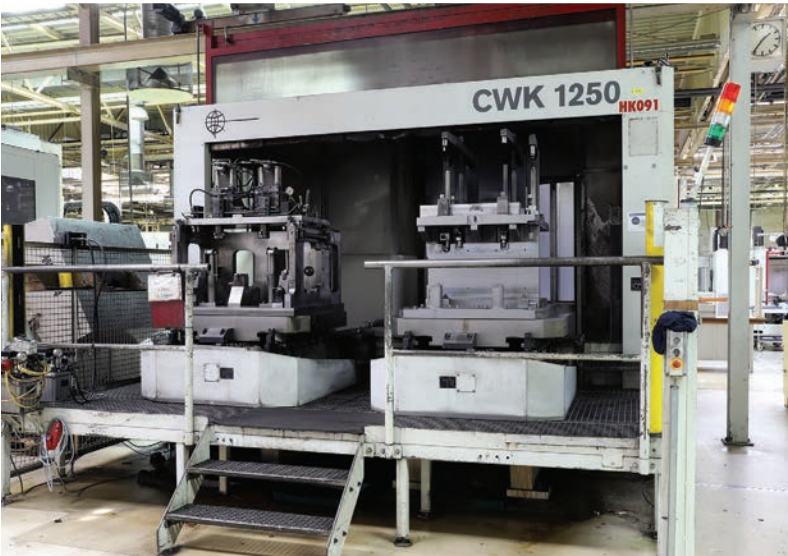
STARRAG-HECKERT CNC Horizontal-Machining Centers