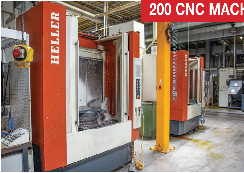
HELLER CNC Machining Centers