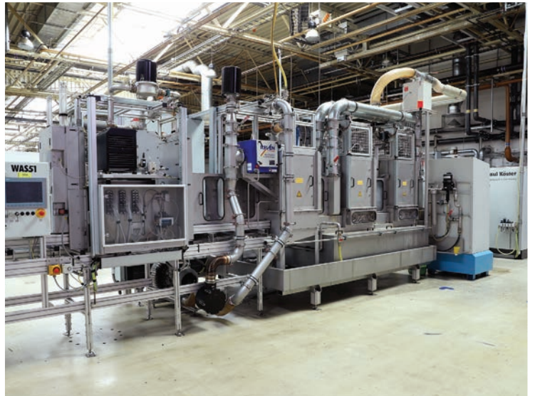
Parts Washing Machine