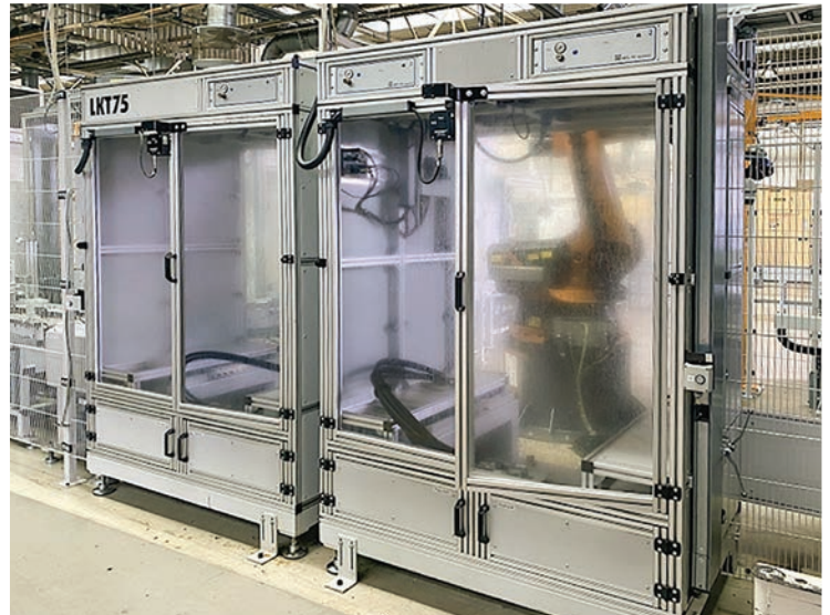
PAUL KÖSTER Leak Testing Station