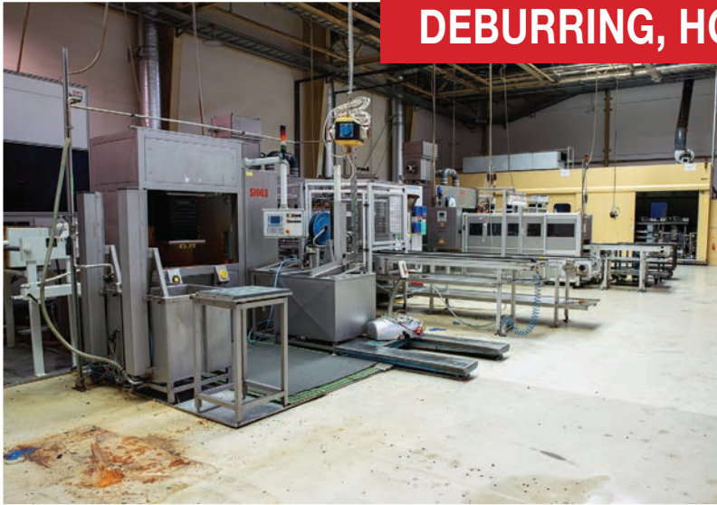
SITEC Deburring Machines