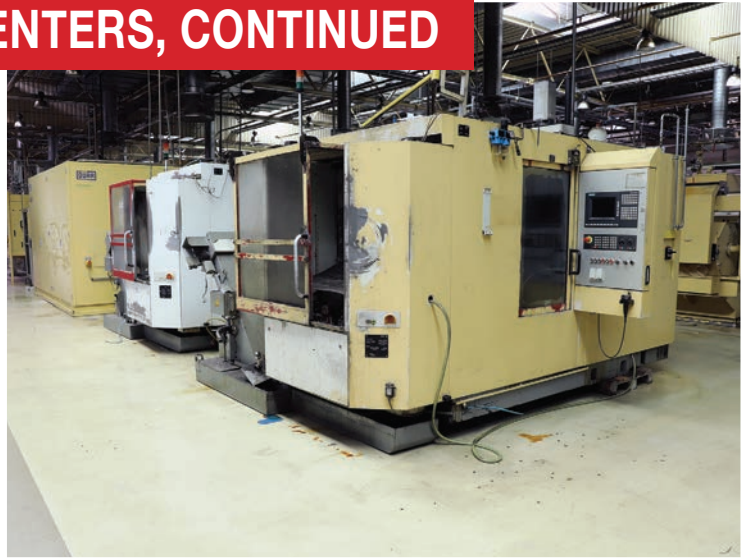
HECKERT CNC Machining Centers with Dürr Cleaning Machine