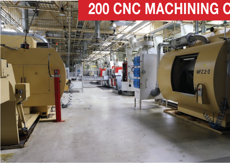
SAMAG CNC Horizontal Machining Centers