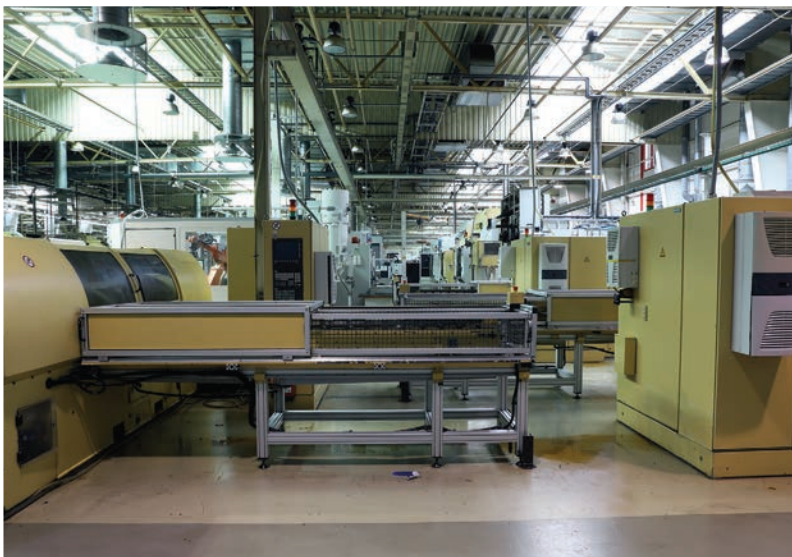
IXION CNC Deep Drilling Machine